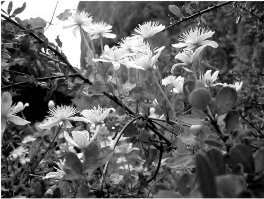
Clematis lasiantha, Pinnacles National Monument.

California Native Plant Society East Bay Chapter P.O. Box 5597, Elmwood Station Berkeley CA 94705