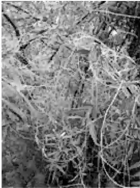
Japanese dodder attacking willow tree.

A new pest parasite, Cuscuta japonica or Japanese dodder, has been found invading the East Bay. Please be on the lookout and inform your county agriculture office if you see it.