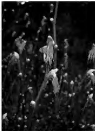
Western leatherwood ( Dirca occidentalis), Huckleberry Regional Botanical Preserve. D. occidentalis is a rare species.