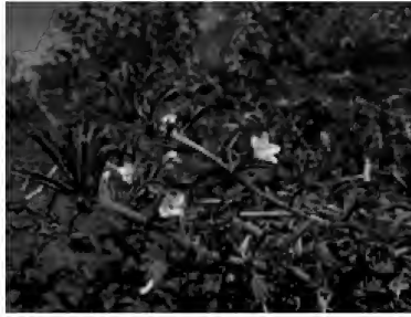
Small-flowered morning glory Convolvulus similans