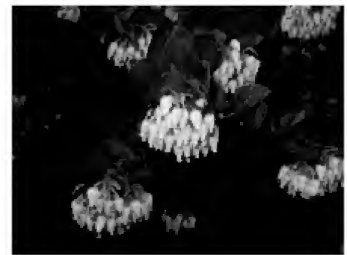
Pallid manzanita ( Arctostaphylos pallida), Huckleberry Regional Botanical Preserve. A. pallida is a rare species.