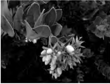
Mt. Diablo manzanita Arctostaphylos auriculata