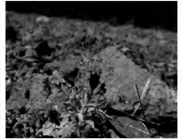
Spring Lessingia Lessingia tenuis