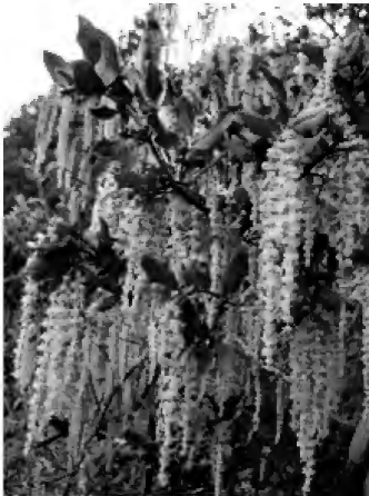
Coast silk tassel ( Garrya elliptica), Huckleberry Regional Botanical Preserve.