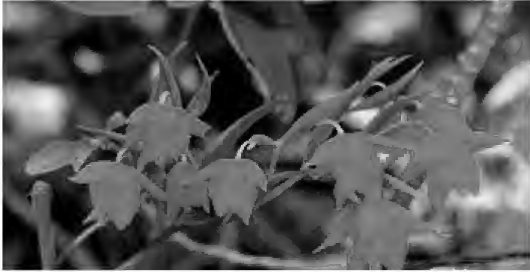
More photos from Bear Valley. Clockwise from upper left: Leptosiphon sp., western flax ( Hesperolinum sp.) and Diogenes ' lantern ( Calochortus amabilis ).