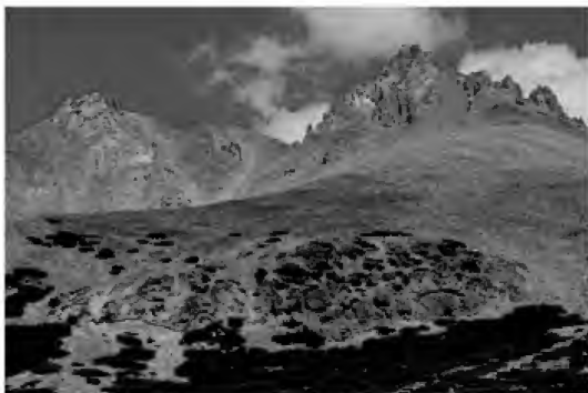
Possible habitat for B. pumicola in the pumice and low conifers is seen in this view of Shastina from the treeline.