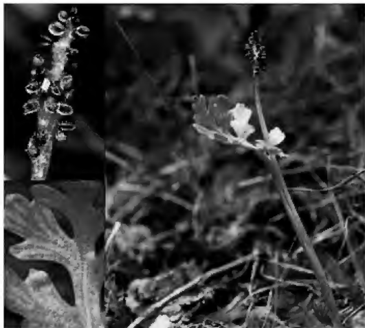
Botrychium pinnatum in forest on Mount Shasta, 1997