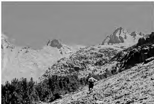
Hiking up Diller Canyon