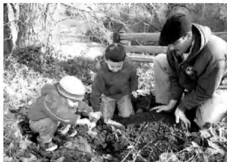
Planting a blue elderberry at Marsh Creek