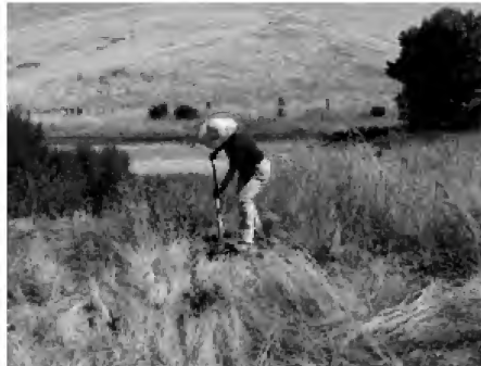
Weeding around the roses at Bayberry Pond