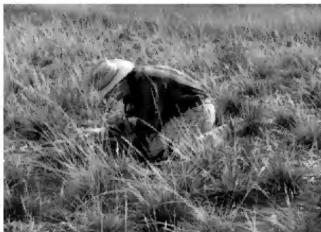
Weeding a one-year-old native grass patch