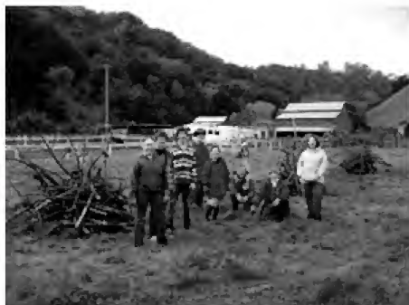
Strenzel Meadow crew

Officers and Committee Chairs serve on the Board.