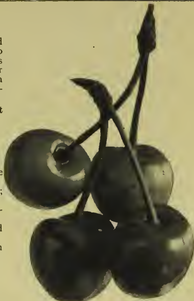
Napoleon Bigarreau Cherries.

Black Eagle. Black; tender and highly flavored. July.