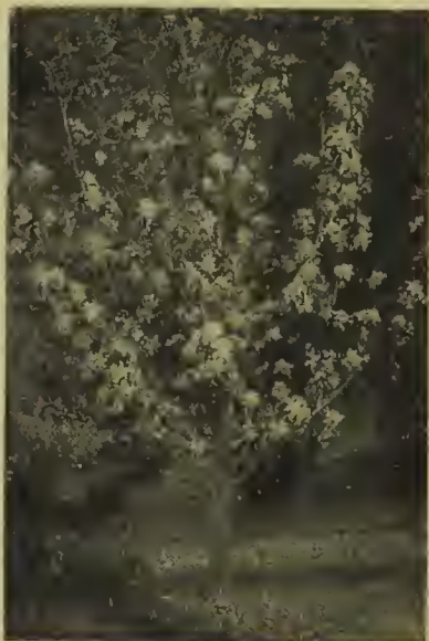
Dwarf Apple the second year after you buy it. Just the tree for the small city lot.

York Imperial. Large, red apple of agreeable flavor. Nov.-Feb.