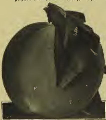
Mountain Rose Peach.

Clapp's Favorite. Large; fruit fine-grained and good for eating. Sept.