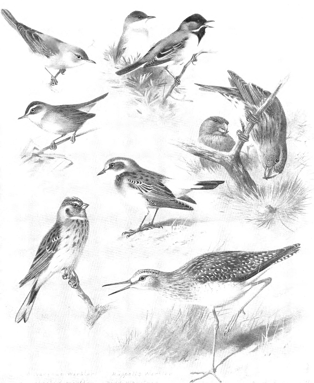
Olivaceous Warbler Black-throated Warbler Pine Siskin