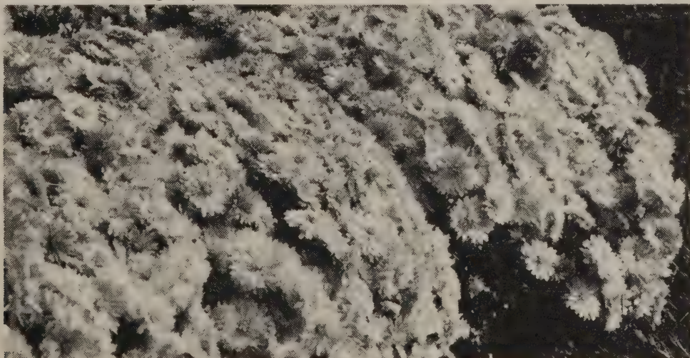
Ever-Popular Cushion Mums

Thirty garden mums of 10 or more varieties, our selection and unlabeled, for only $3.00 postpaid. State your choice, whether you would like tall varieties or low-growing types, or half of each. These are strong field divisions from our collection of over 300 varieties, the same size that we plant to give our fields a riot of color in the fall.