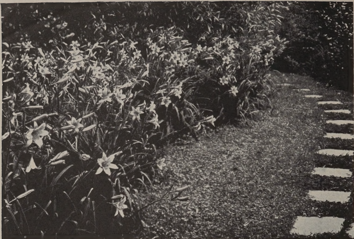
Daylilies Provide Carefree Garden Color for Years and Years