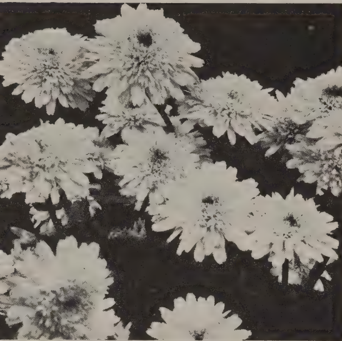
Shasta Daisies, Wirral Supreme

We grow many perennials that can be picked up at our garden, but will list here only a few of the nicer things that "travel well," for shipping. Shipped April, May, Sept. and Oct.