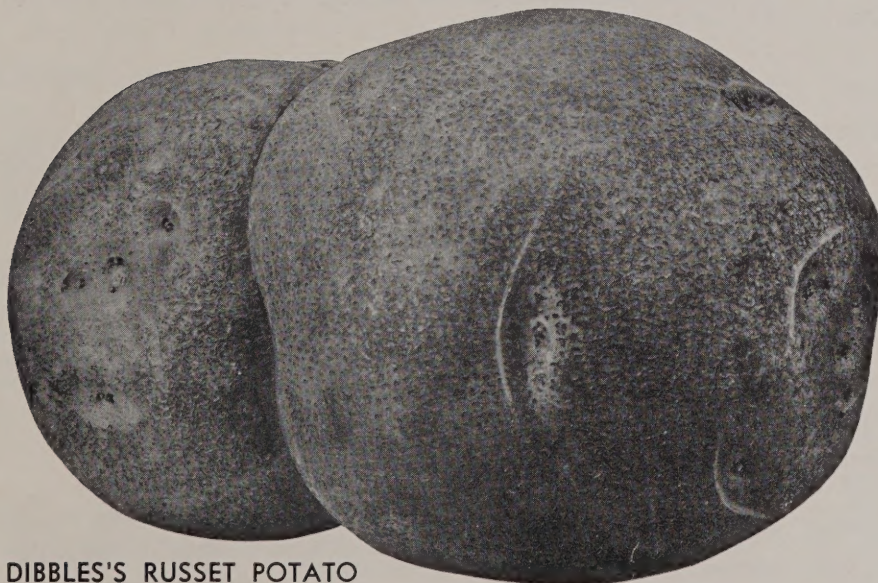
DIBBLES'S RUSSET POTATO

We assume responsibility that the seeds or tubers reach the purchaser in good condition. We offer to refund the purchase price of any seeds or tubers found by tests to be unsatisfactory to you within ten days after the seeds or tubers reach you. In common with all responsible seedmen "The Edward F. Dibble Seedgrower Company warrants to the extent of the purchase price that seeds or tubers sold are as described on the containers within recognized tolerances. Seller gives no other or further warranty express or implied."