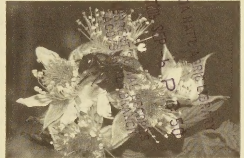
An Osmia aglaia female pollinates a black raspberry flower.

Bumble bees are some of our most efficient crop pollinators. When forage is available early in the growing season (like willow, red bud, maple, or manzanita), freshly emerged, overwintering bumble bee queens are more successful in establishing their colonies. Also, some solitary bees produce multiple generations each year, so reproductive success in the spring and early summer can lead to larger populations in the mid- to late-summer, when many fruits and vegetables are in bloom.