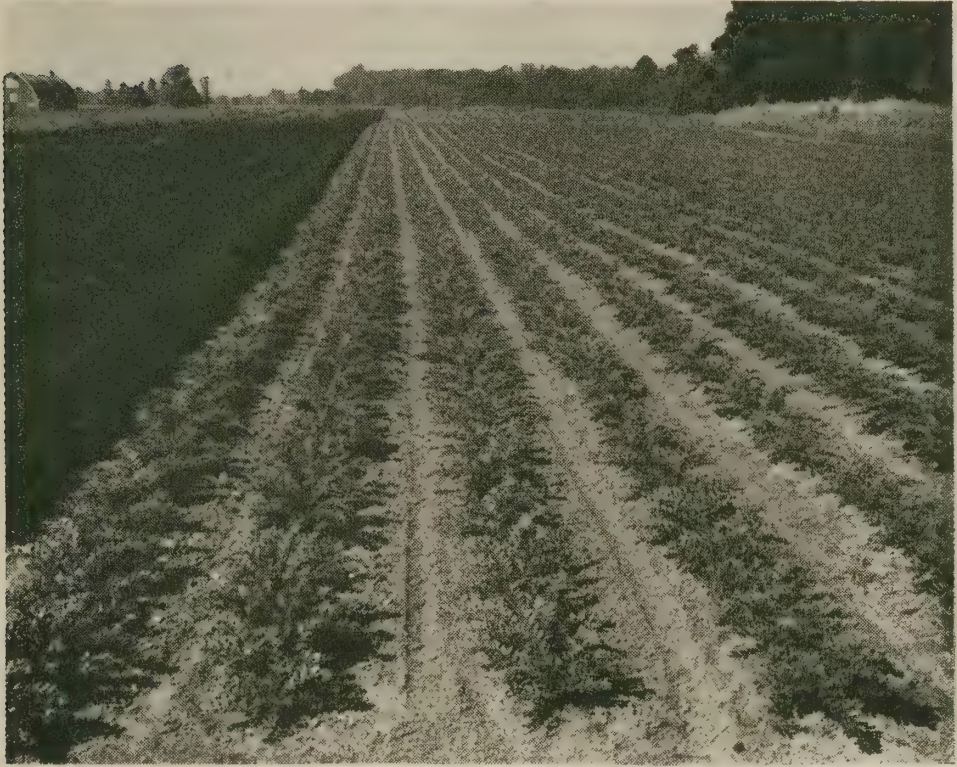
Some of our splendid, stocky Ligustrum ibota regelianum .

Ovalifolium (California Privet). 8 to 10 ft. Although more than seventy years have passed since the founder of this business introduced California Privet as a hedge plant, we believe this is still the most popular hedge plant in the United States.