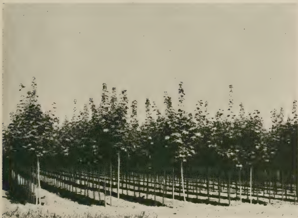
Part of our large supply of strictly first class Norway Maples.