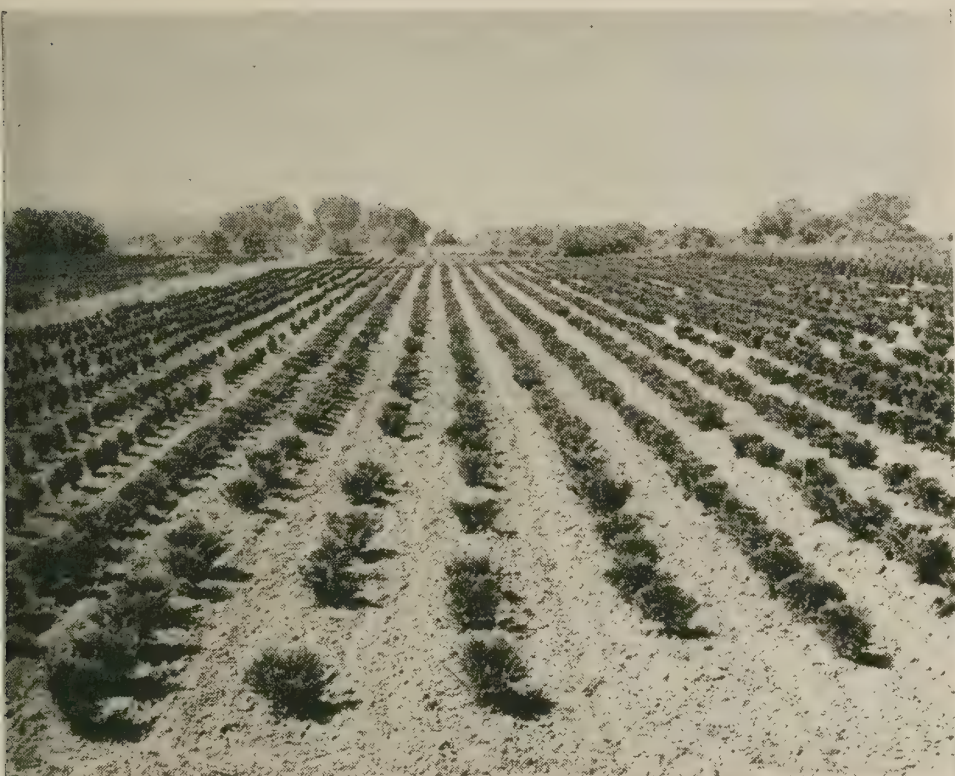
Some of our Upright growing Taxus.

Cuspidata nana (brevifolia) (Dwarf Japanese Yew). 4 to 5 ft. Slow growing. Is excellent for permanent low effects.