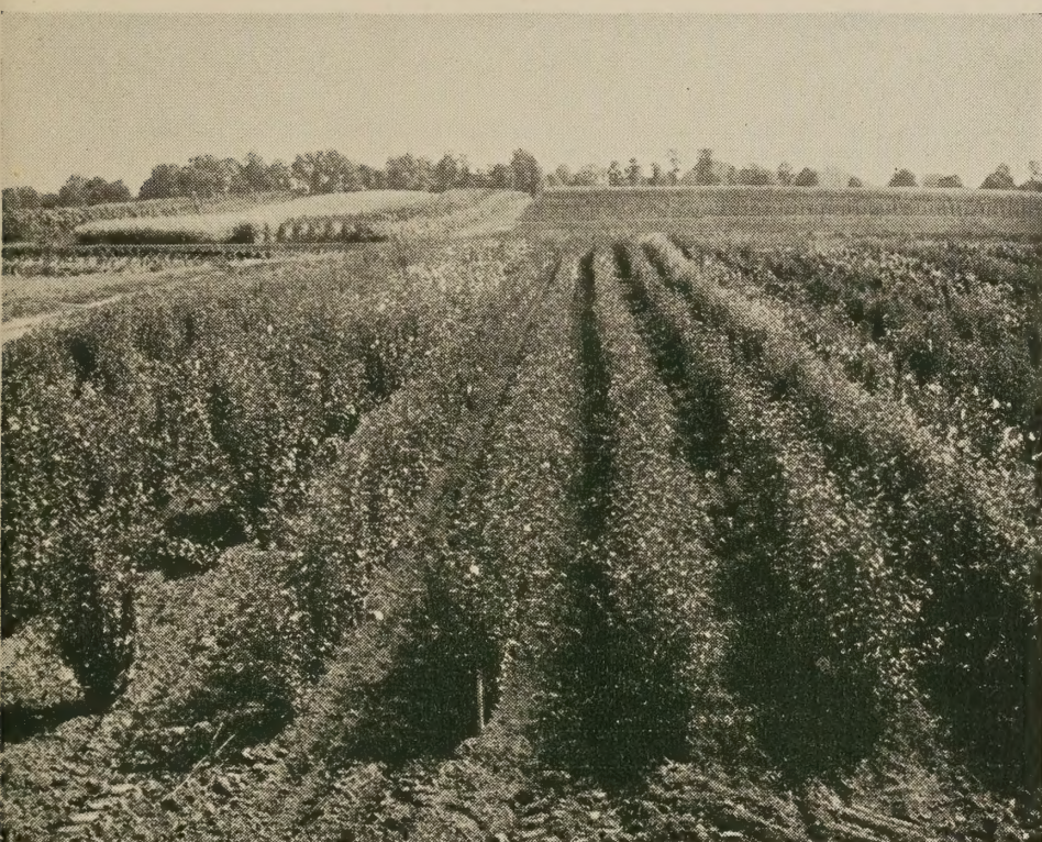
One of our many blocks of splendid, well grown two year old Shrubs.

Prices quoted do not include cost of packing. See Terms and Conditions of Sale on inside of back cover.