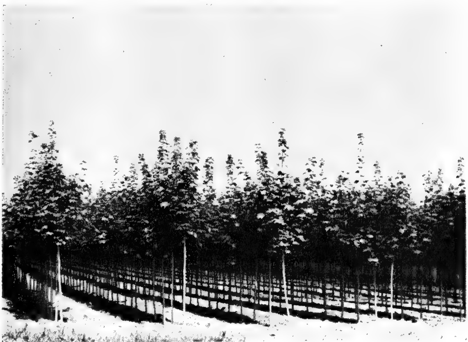
Part of our large supply of strictly first class Norway Maples.