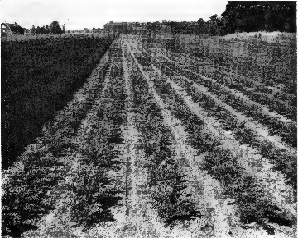
Some of our splendid, stocky Ligustrum ibota regelianum .

Ovalifolium (California Privet). 8 to 10 ft. Although more than seventy years have passed since the founder of this business introduced California Privet as a hedge plant, we believe this is still the most popular hedge plant in the United States.