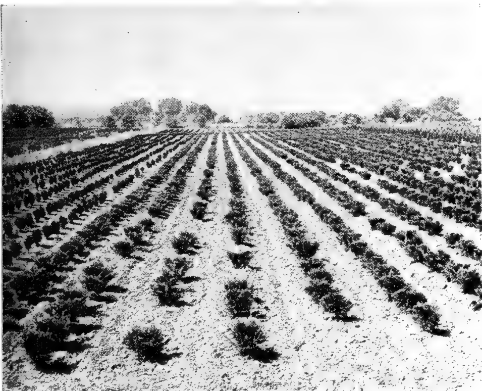
Some of our Upright growing Taxus.

Cuspidata nana (brevifolia) (Dwarf Japanese Yew). 4 to 5 ft. Slow growing. Is excellent for permanent low effects.