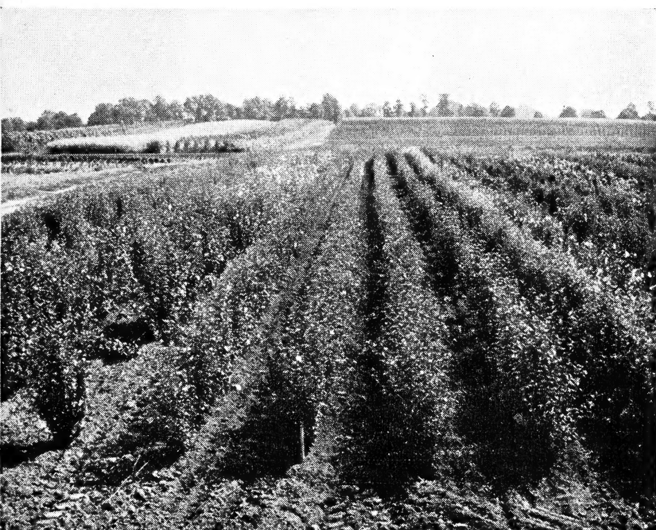
One of our many blocks of splendid, well grown two year old Shrubs.

Prices quoted do not include cost of packing. See Terms and Conditions of Sale on inside of back cover.