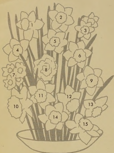
See color illustration on page 28