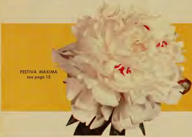
FESTIVA MAXIMA see page 15