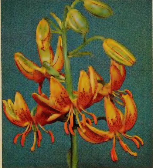
HANSONI see page 10