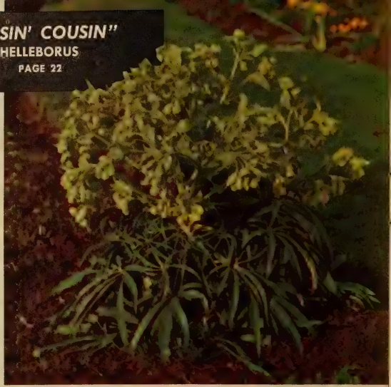
GREEN HELLEBORUS see page 2