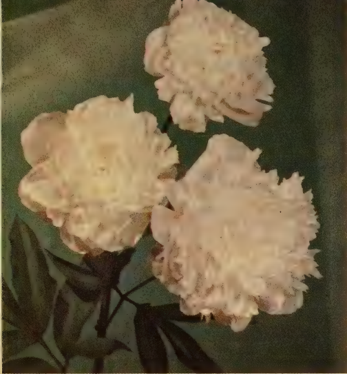
KELWAYS GLORIOUS see page 18