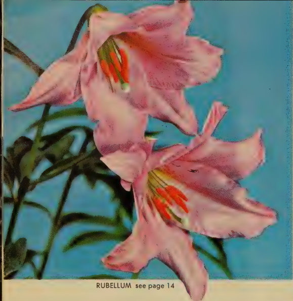
RUBELLUM see page 14