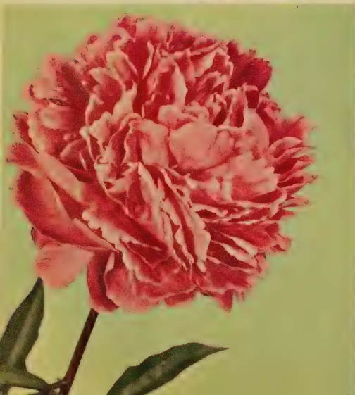
AUGUSTE DESSERT see page 15