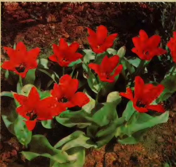
KAUFMANNIANA HYBRIDS see page 23