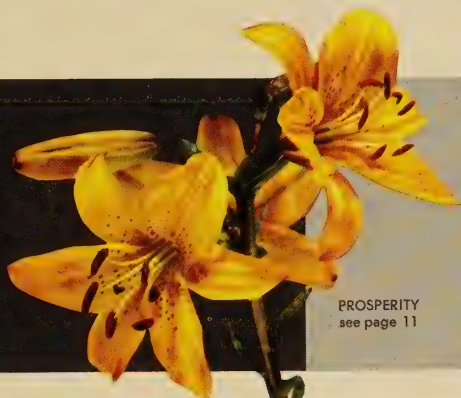
PROSPERITY see page 11