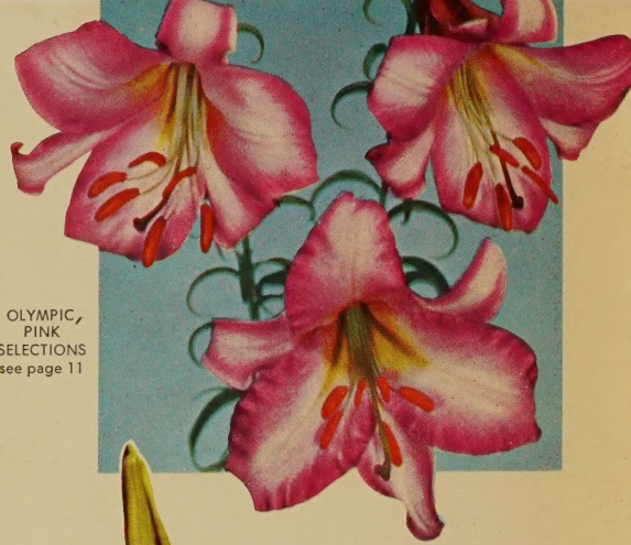
OLYMPIC, PINK SELECTIONS see page 11