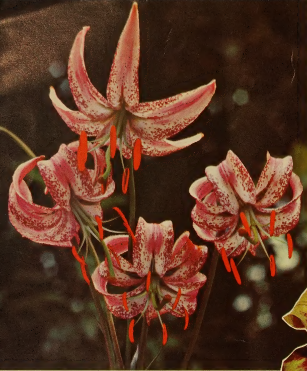
LANKONGENSE see page 10