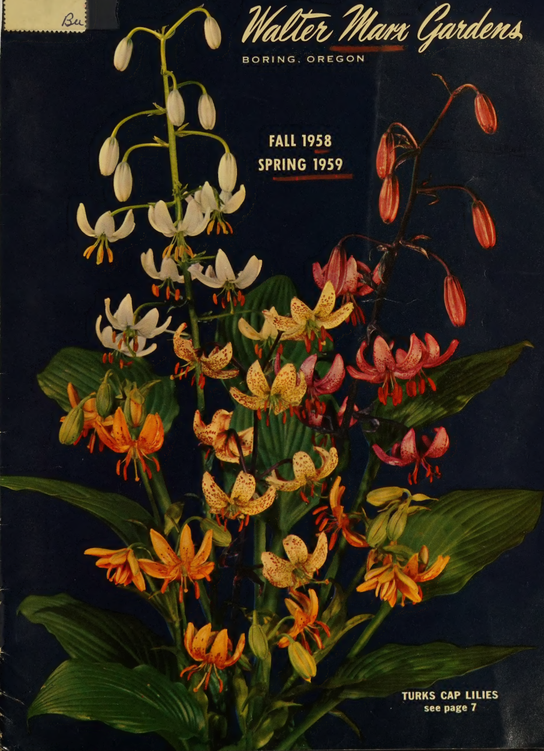
TURKS CAP LILIES see page 7

LILIES • PEONIES • POPPIES • TULIPS • DAFFODILS