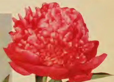
HIGH ADVENTURE see page 15