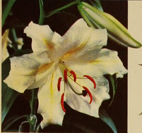
AURATUM PLATYPHYLLUM TRICOLOR see page 6

NO FLOWER GARDEN IS COMPLETE WITHOUT THE LILIES