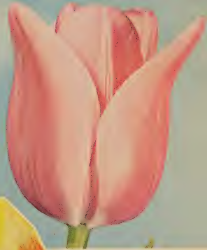
PRIDE OF ZWANENBURG see page 26