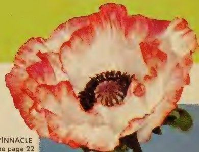
PINNACLE see page 22