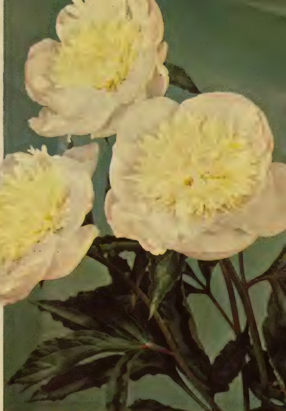
WATERLILY see page 19