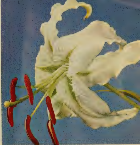
SPECIOSUM ALBUM see page 14

RUBELLUM L. SPEC. RUBRUM L. CENTIFOLIUM MIDCENTURY HYBRIDS SUNSET LILY L. SPEC. ALBUM AURATUM PLATYPHYLLUM PROSPERITY HANSONI FIESTA HYBRIDS