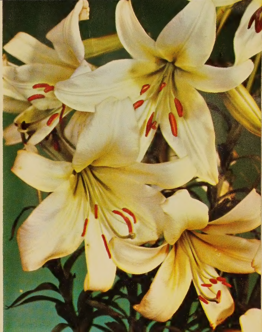
HEARTS DESIRE see page 7