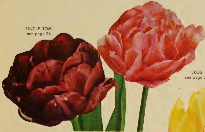
EROS see page 26