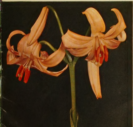
TESTACEUM, NANKEEN see page 14