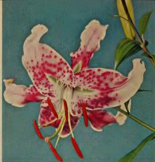
SPECIOSUM RUBRUM see page 14