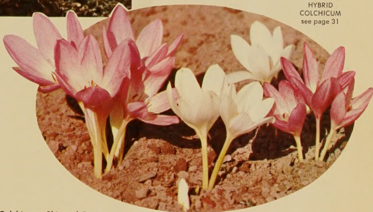
Colchicums Shipped During Late Summer Months

Sprightly little flowers for the partly shaded garden, very like refined miniatures of the florist's cyclamen. The pert and charming blooms, interesting foliage, curiously coiled seed stems combine in one of the most interesting personalities of the flower world.