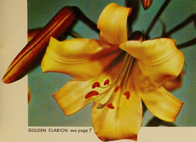
GOLDEN CLARION see page 7