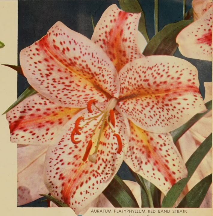
AURATUM PLATYPHYLLUM, RED BAND STRAIN see page 3