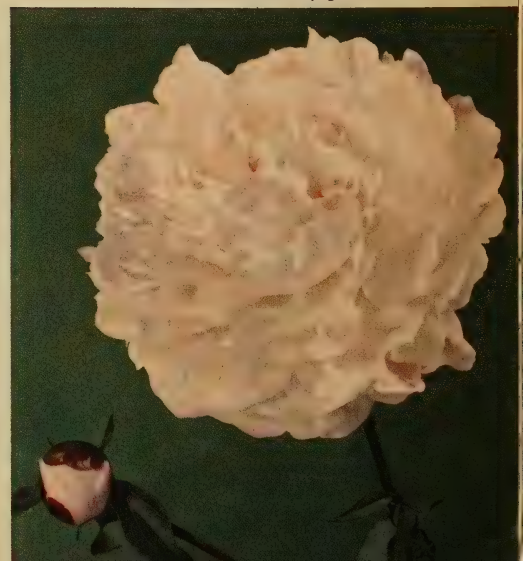
MYRTLE GENTRY see page 18