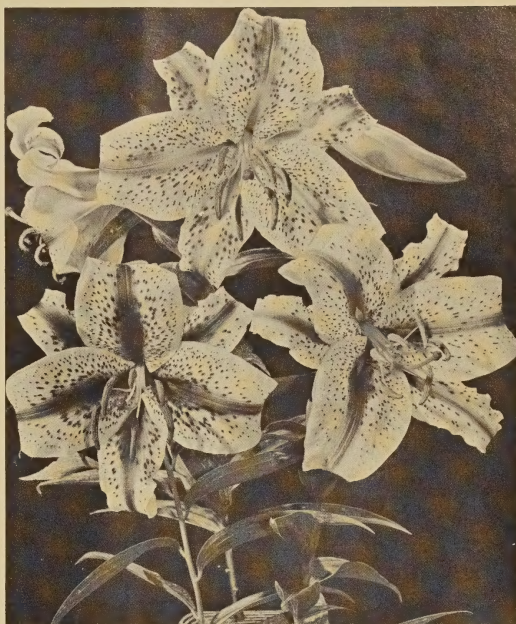
Auratum platyphyllum , Red Band Strain

This Lily is of Mid-Century type but flowers several weeks earlier. It lasts unusually long and burns less in the sun than any other dark red variety. Plants average from three to four feet in height, of which the lower 18 inches is clothed with narrow, recurved leaves. The racemose inflorescence, which is spread quite widely, carries up to 20 flowers. The flowers are large, broad-petaled and widely open, of a dark chestnut-red color, with black spots. They look especially well in the brightest of sunlight. The petals drop off as soon as they begin to fade; consequently the plant remains neat and tidy until the last flower is gone. The bulbs are of a good, firm type and easy to propagate. This Lily definitely is one that improves on better acquaintance and we feel certain that it will be one to be cherished by many a gardener, fortunate enough to obtain some of the limited stock available this year. 5" bulbs.