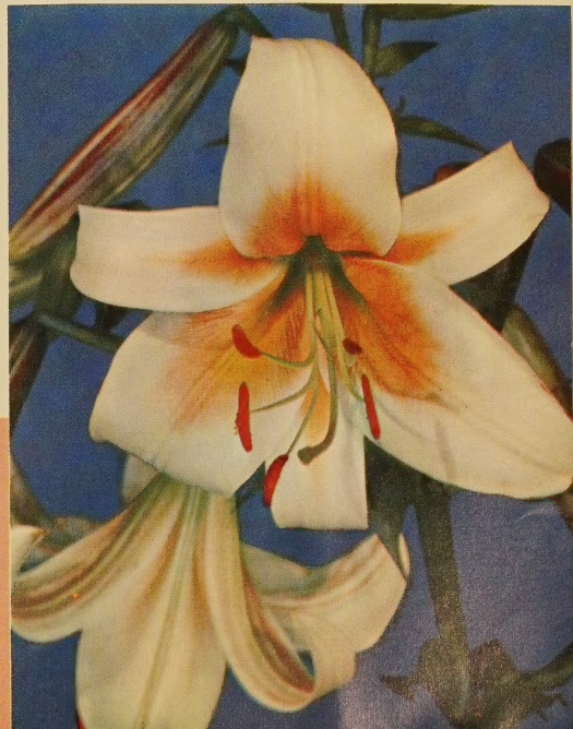
CARNIVAL see page 7

This cash discount does not apply to collection offers.