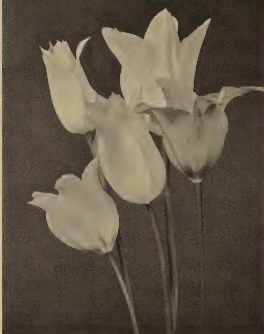
Lily Flowered Tulips

SWEET HARMONY (Darwin) 3 for .75; 6 for 1.40; 12 for 2.25 If you want something different in tulips then try this enchanting variety. Color is clear lemon yellow edged ivory white. Large flower and late.