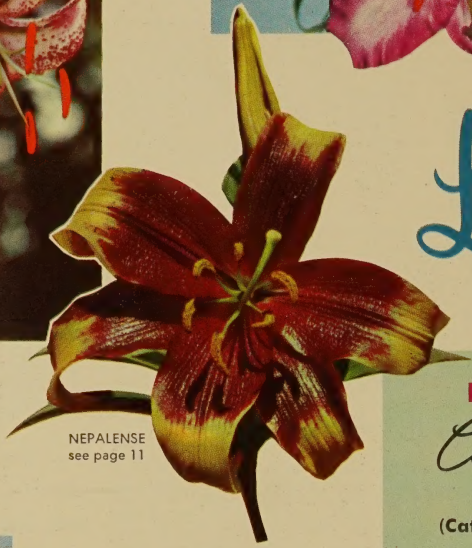
NEPALENSE see page 11