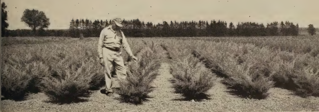
JUNIPER chinensis glauca hetzi—Hetz Blue Juniper. Rapid growing and vigorous. Excellent in contrast with dark green evergreens.