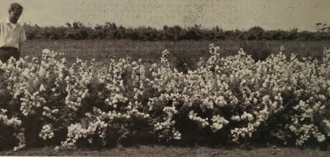
DEUTZIA Lemoinei —Lemoine Deutzia. Probably the finest of all medium growing heavy flowering Deutzias.

Unit Price in Quantities 1-9 10-49 50-249