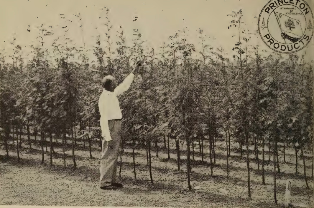
SORBUS aucuparia — European Mountain Ash. Extra fine.

Unit Price in Quantities 1-9 10-49 50-249