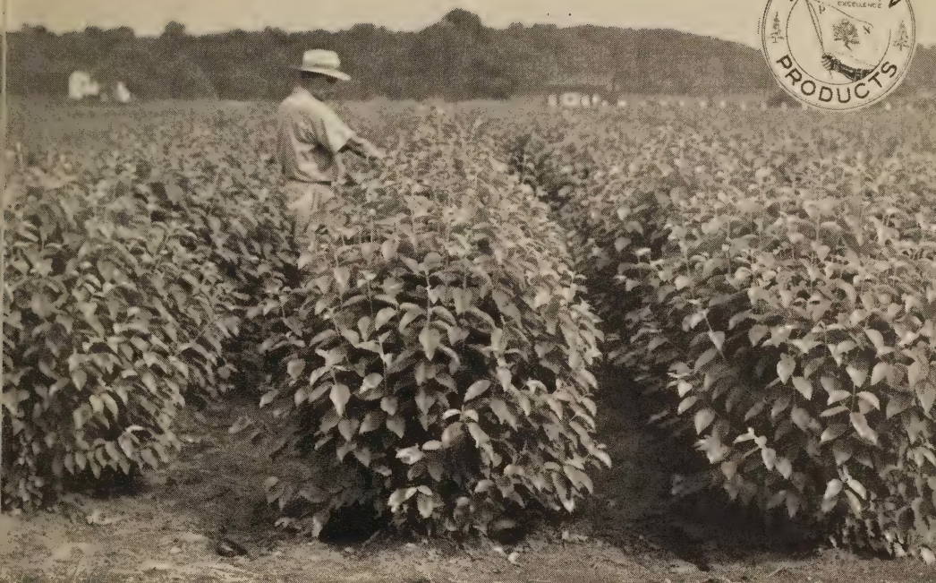
VIBURNUM tomentosum — Doublefile Viburnum. We grow extremely fine Viburnums.