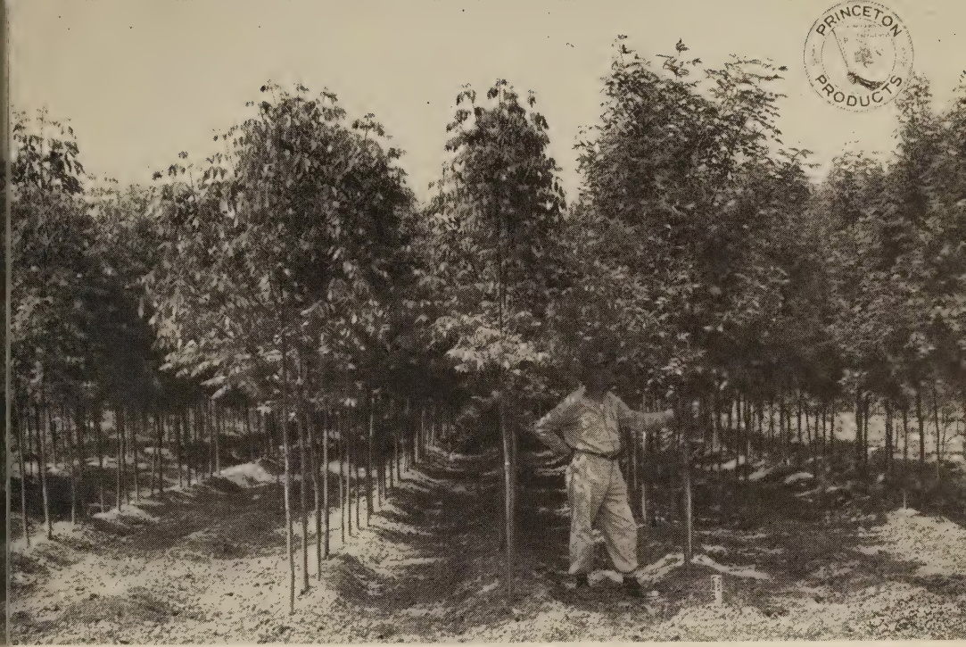
FRAXINUS americana—White Ash. FRAXINUS lanceolata—Green Ash. This is a very fine straight trunked well branched lot.