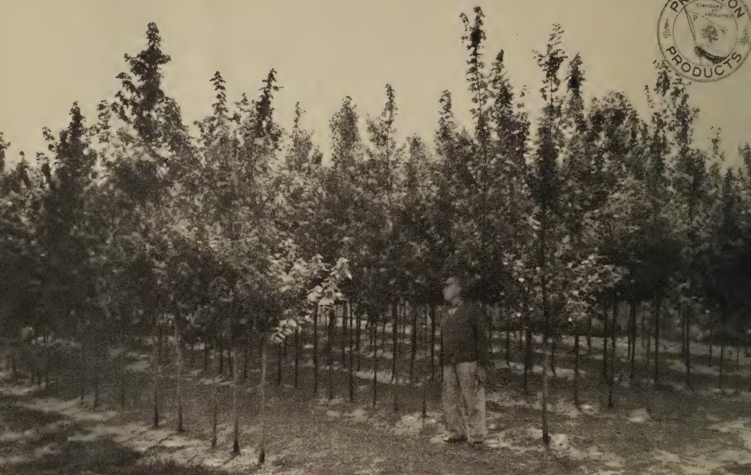
ACER rubrum—Red or scarlet maple. Well balanced tops and straight trunks.