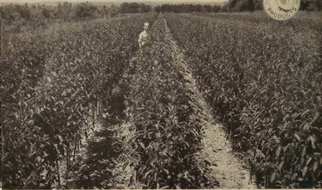
MALUS—Flowering Crab. Picture taken in May. This will be a 2 year block in the Fall. As you can see, they will have nicely balanced full tops and heavy straight trunks.