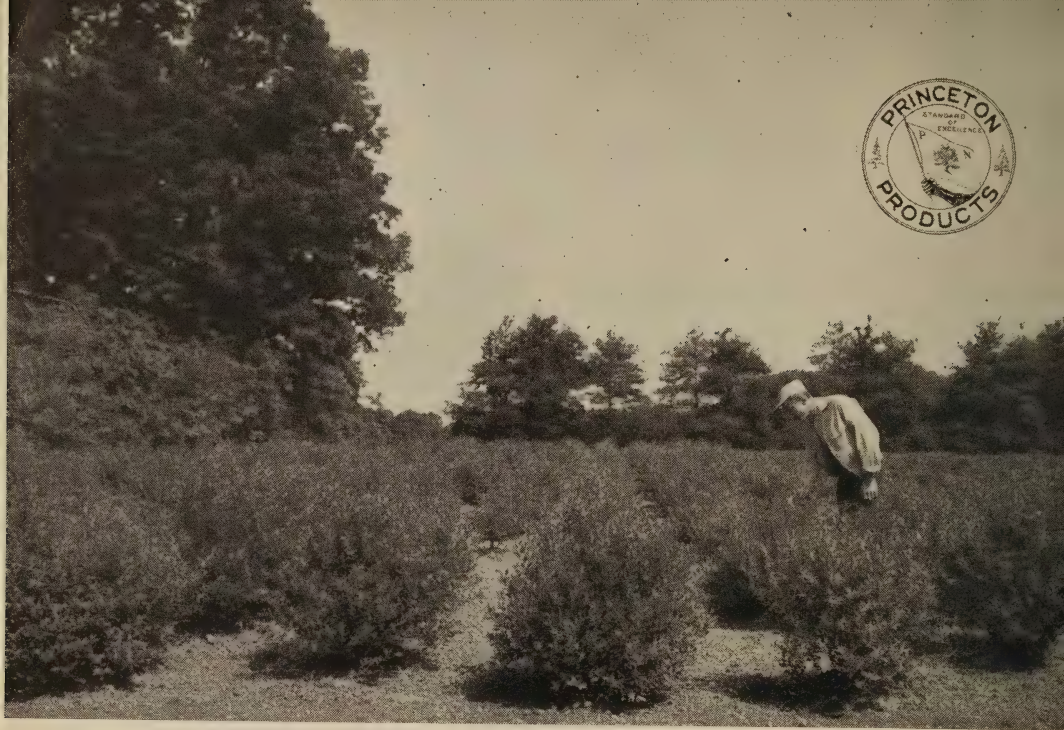
ILEX glabra—Inkberry. An excellent landscape variety. Tolerates partial shade.