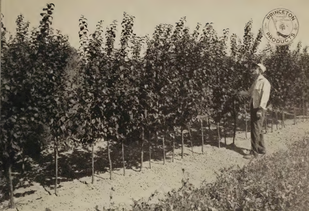
PRUNUS thundercloud—Purple-leaved flowering Plum. The richest colored foliage of all purple plums.

Unit Price in Quantities 1-9 10-49 50-249