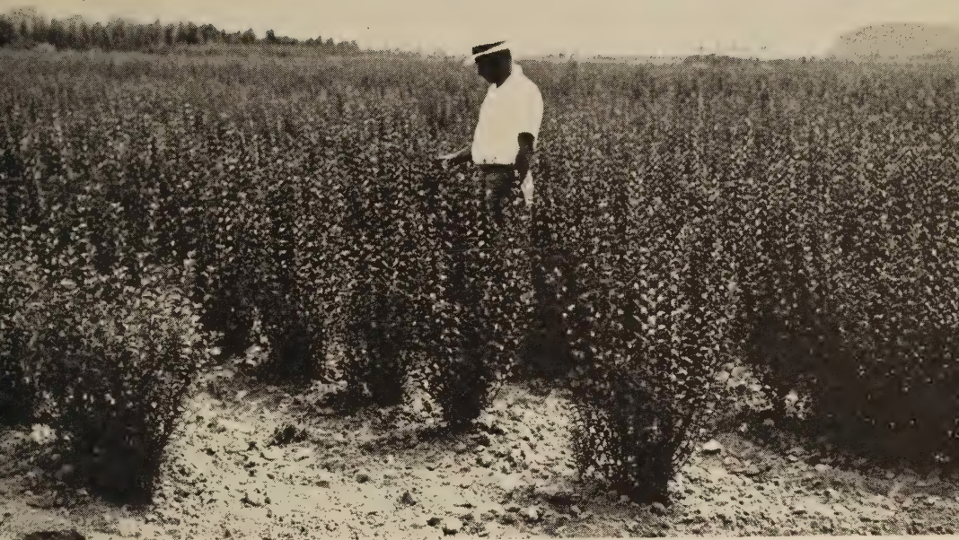
LIGUSTRUM ovalifolium —California privet. Ours are heavy cut-back plants.

Unit Price in Quantities 1-9 10-49 50-249