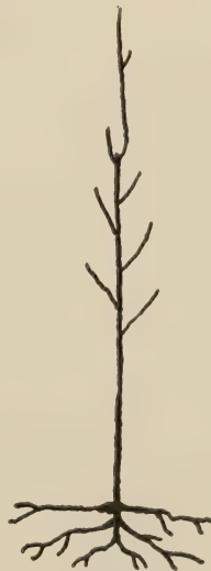
Norway Maple, London Plane, Shademaster Locust, etc.