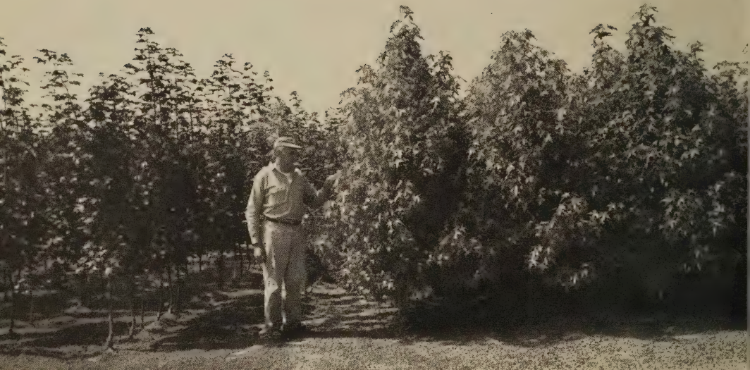
LIQUIDAMBAR styraciflua —Sweet Gum. ACER platanoides CRIMSON KING —Crimson King Maple, at left. Extra nice, straight well branched trees.