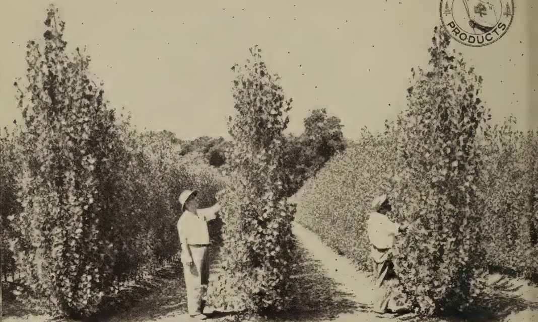
POPULUS nigra italica — Lombardy Poplar. Single trunks, branched from grown.

Unit Price in Quantities 1-9 10-49 50-249