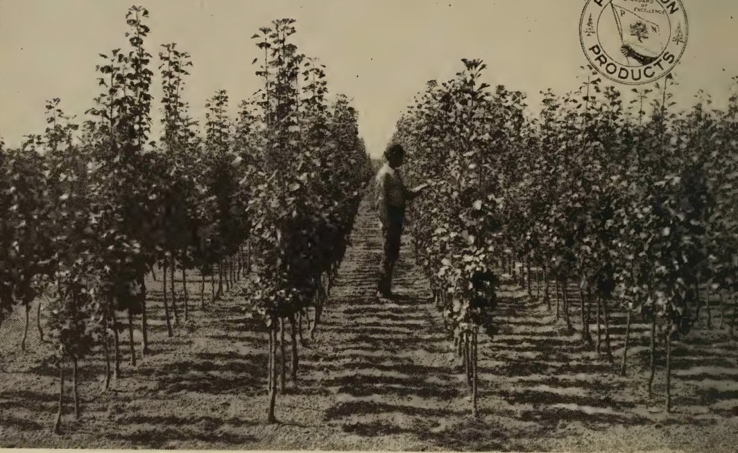
GINKGO biloba — Maidenhair Tree. Ours are an extremely fine lot. Good straight trunks.