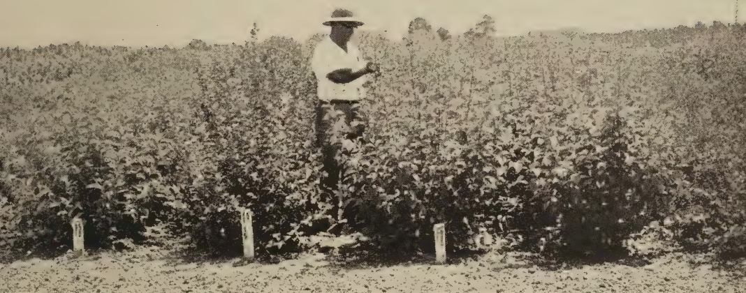
2 year cut back shrubs. Our flowering shrubs are a very fine heavy lot.