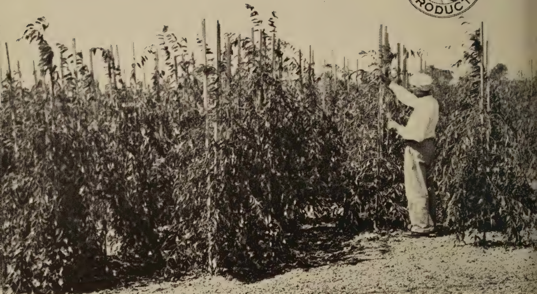
PRUNUS subhirtella pendula — Weeping Japanese Cherry. On their own stems. Absolutely hardy. Will have a limited quantity.