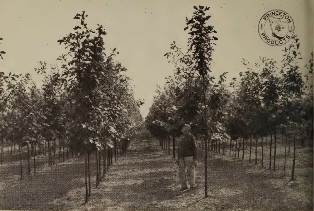
QUERCUS borealis (rubra)—Northern Red Oak. The last word in Red Oaks.