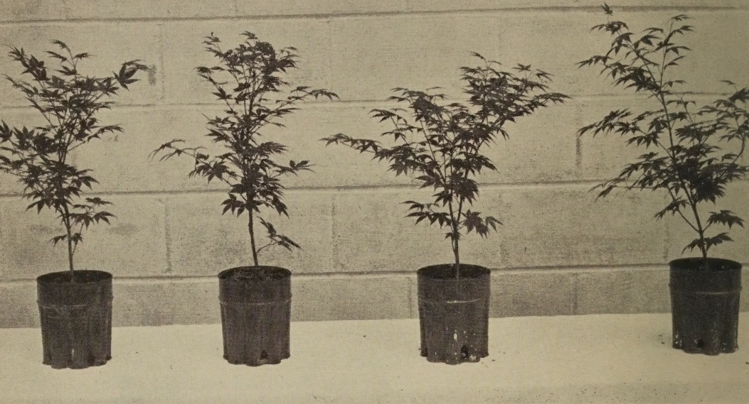
ACER palmatum atropurpureum—Japanese Red Maple. Excellent grafted plants in gallon cans. A natural for sales yard operations.