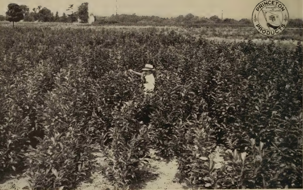
MAGNOLIA soulangeana — Saucer Magnolia. Heavily branched plants. Grown the Princeton way.

Unit Price in Quantities 1-9 10-49 50-249