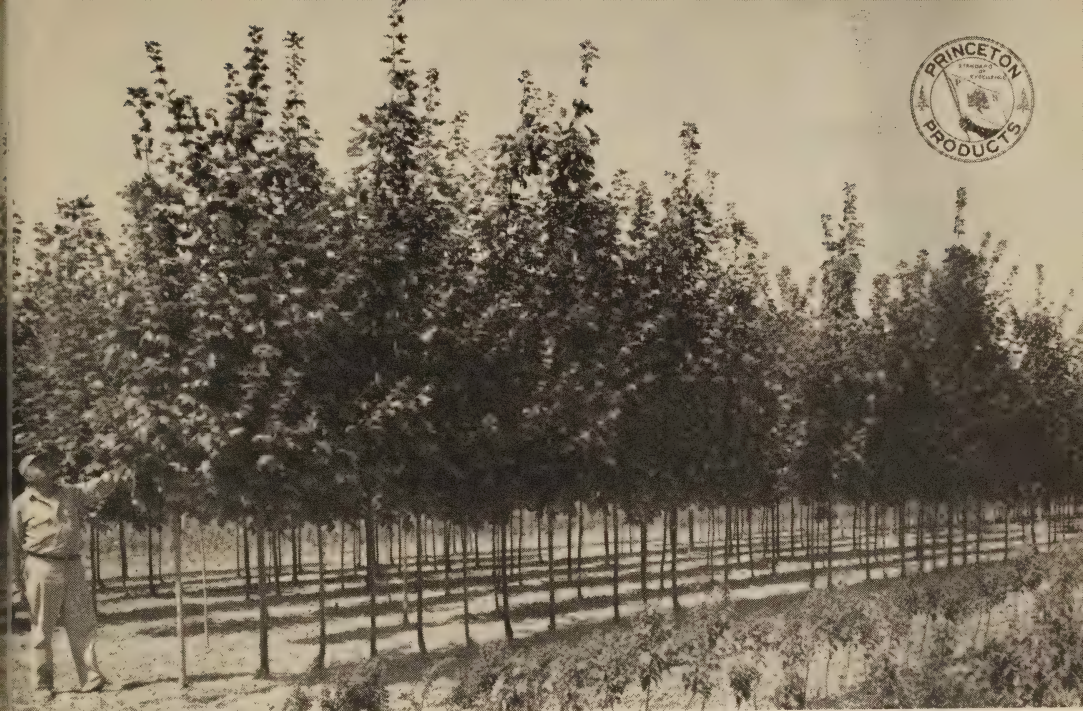
ACER saccharum—Sugar Maple. You never saw finer Sugar Maples.

Unit Price in Quantities 1-9 10-49 50-249