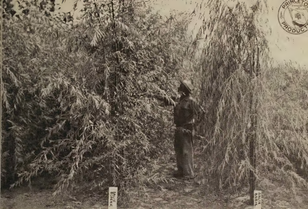
SALIX elegantissima —Thurlow Weeping Willow. SALIX babylonica —Babylon Weeping Willow. Our willows are carefully grown.

Unit Price in Quantities 1-9 10-49 50-249