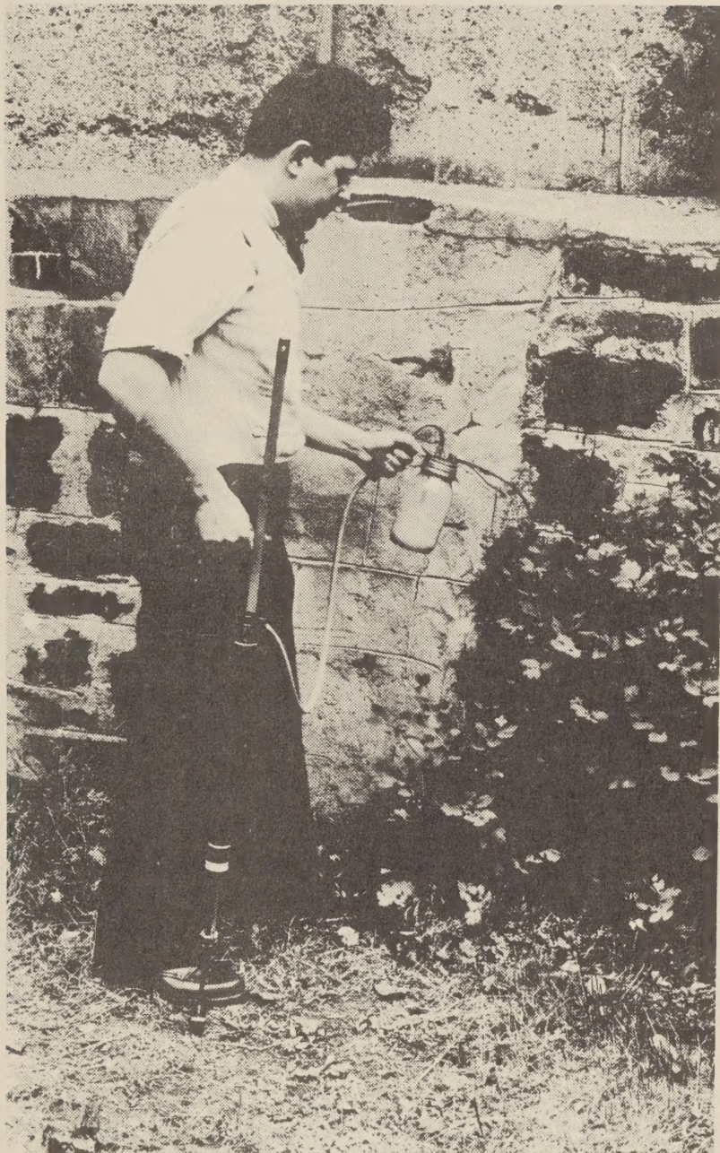
Figure 1.—Equipment in operation. The operator stands with one foot on the foot brace while pumping air through the dust gun.