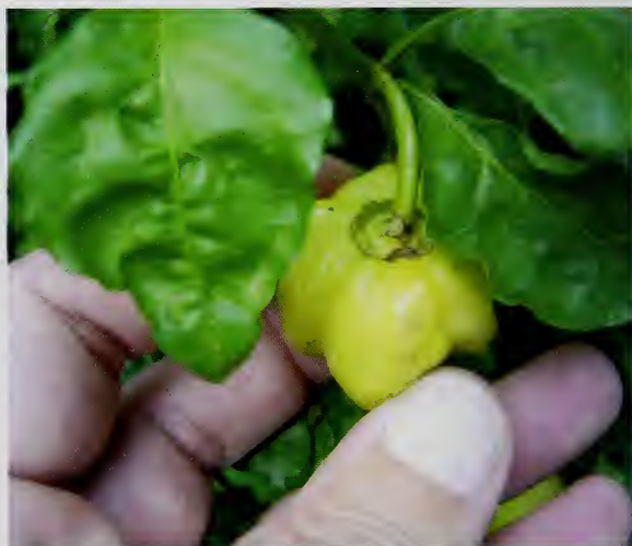
Thrips damage on an immature Wisconsin red pepper.