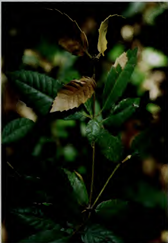
Sudden oak death symptoms on tanoak (Lithocarpus densiflorus).