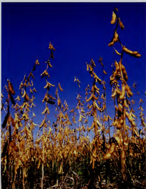
CPHST scientists determine strategies to protect crops, such as these soybeans, from foreign pests.

Activities that the RPA team primarily focuses on include the analysis of risks posed by emerging and reemerging plant pests and invasive species. Many of these analyses are associated with the import and export of agricultural commodities. Analyses may also deal with specific organisms or pathways. Specific projects are coordinated by the National Science Program Leader and reviewed by the Board of Directors of CPHST.