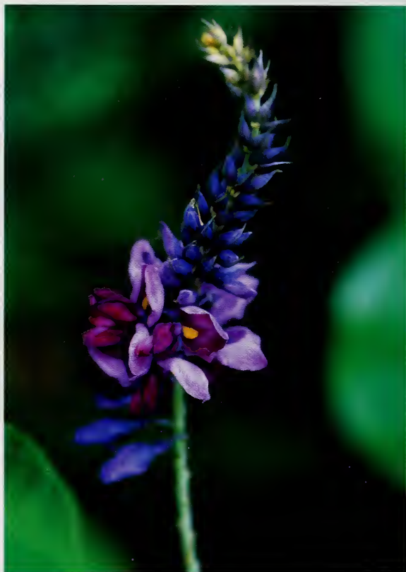
Flowering kudzu is a fast-growing exotic weed with a grapelike odor.

The analyses produced by the RPA group help APHIS–PPQ to design risk-based regulations for imports, in addition to domestic pest-management programs. The work of the staff is important for identifying and assessing new pest threats, monitoring the effectiveness of existing programs, and helping to prioritize available resources to maximize protection capabilities.