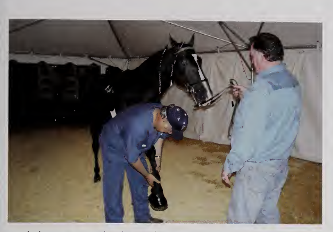
IES helps to ensure that horse shows comply with the Horse Protection Act.