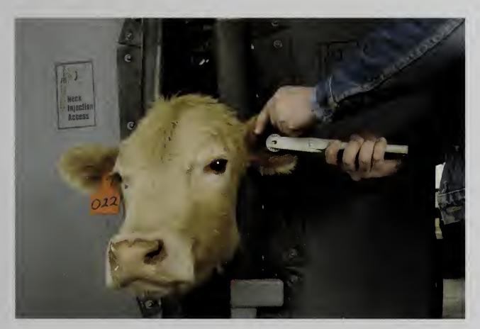
Proper identification allows IES to trace the movements of livestock in a disease outbreak.

IES cases typically include investigating the illegal smuggling of forbidden animal or plant products (working in cooperation with APHIS' Plant Protection and Quarantine program) or enforcing APHIS' Animal Care program standards for breeders of dogs at the wholesale level.