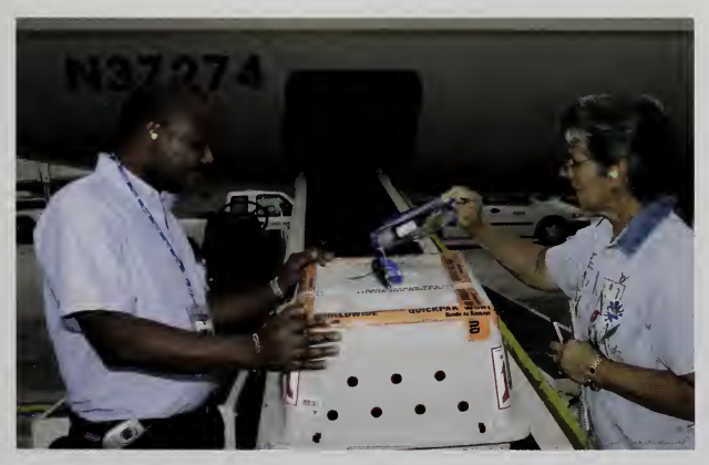
IES investigates the mishandling of animals in transit on commercial carriers.

Convention on International Trade in Endangered Species of Wild Fauna and Flora (CITES); and Lacey Act.