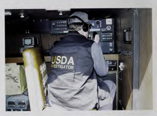
A USDA field investigator uses technology to conduct surveillance.