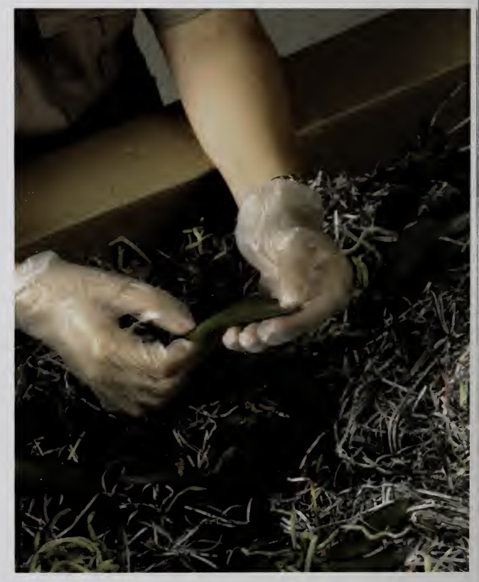
A plant health safeguarding specialist examines imported plants to prevent the introduction of foreign pests or diseases into the United States.

IES is a highly effective investigative and enforcement organization, recognized for its technical sophistication, integrated partnerships, and skilled workforce, in support of the APHIS mission.