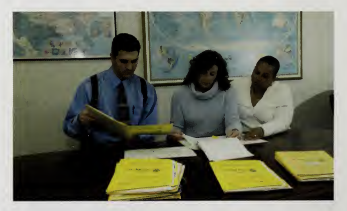
Staff members in IES' Enforcement Operations Branch participate in a response team to quickly process cases for submission to USDA's Office of the General Counsel.