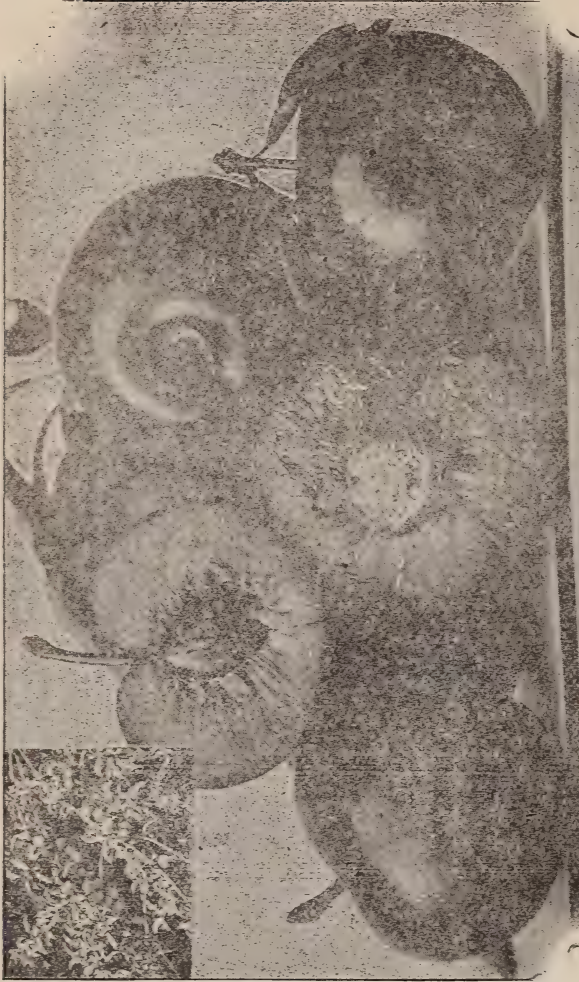
MARU (Most. Massu).

good. It is not settled whether this and Red June are identical. I have the two varieties from different sources, but have not fruited either. They are kept separate in propagating. This is fully as early and superior every way to Willard, and pronounced one of the best Japans.