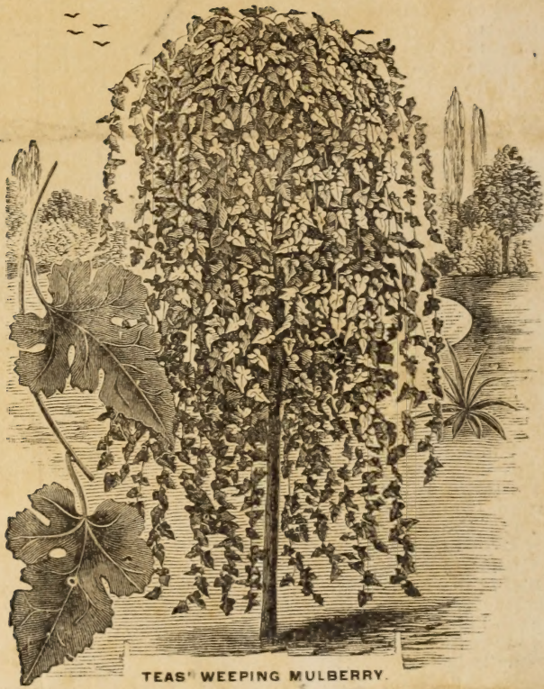
TEAS WEEPING MULBERRY.