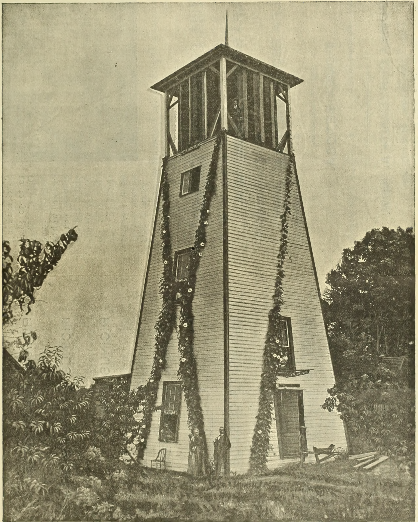
VIEW OF HYBRID MOONFLOWERS AS GROWN BY A. W. SMITH, AMERICUS, GA. Height to Base of Wheel 42 Feet, to Top of Wheel 52 Feet. Seed Planted, April 15th, Photograph taken August 16th.