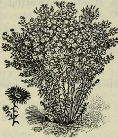
ASTER NOVÆA ANGLIÆ.

Tradescanti —Similar to A. multiflorus . 15 cents each, $1.25 per dozen.