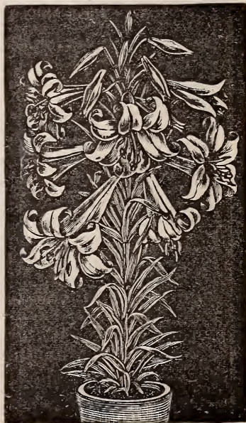
BERMUDA EASTER LILY.

Large, pure white, trumpet-formed flowers of great beauty and fragrance; as a winter bloomer nothing can surpass it. Plant in six to eight inch pots of good soil and set away in a cool, dark place to form roots like other winter-blooming bulbs. It is impossible to describe the charming beauty of this Lily as a pot plant. It requires about three months from time of potting to bloom. Large bulbs 6 cts. each, 50 cts. per dozen. Extra large bulbs 12 cts. each.