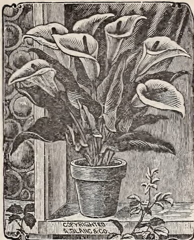
LITTLE GEM CALLA.

SPOTTED LEAF CALLA —The flowers are pure white with a dark throat. Its dark, rich, green foliage is marked and dotted with light spots, making it a highly ornamental plant, even when not in bloom. A very valuable decorative plant either grown out in the garden in summer or in pots. 15c. each. 2 for 25c.