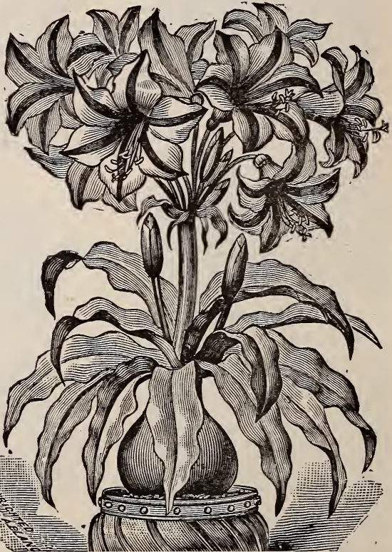
CRINUM KIRKII (OR ORNATUM.)

SCABRUM .—A new variety, even finer than Kirkii. Bulbs are larger and flowers more delicate and exquisite. The six broad petals are a sparkling white, with a light red stripe down the outside, and on the inside a delicate pink blush. A most satisfactory and ideal pot-plant, being managed with