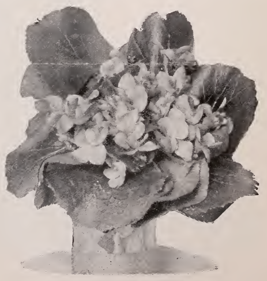
Bunched with Violets.

FOR THE CEMETERY. In winter these pieces last indefinitely in the cemetery, the snow and frost improving rather than injuring them. Galax