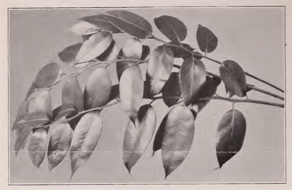
Photograph of Leucothoë Sprays.