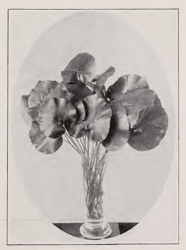
Loose arrangement of Galax, showing long, stiff stems.

HOW WE KEEP GALAX. For the benefit of our customers we keep a large quantity of the finest leaves in cold storage, and supply perfect stock the year round. On large orders we reserve the right to ship direct from our Nurseries in North Carolina, or where quick delivery is assisted. We usually have from three to five million leaves ready to ship on instant notice.