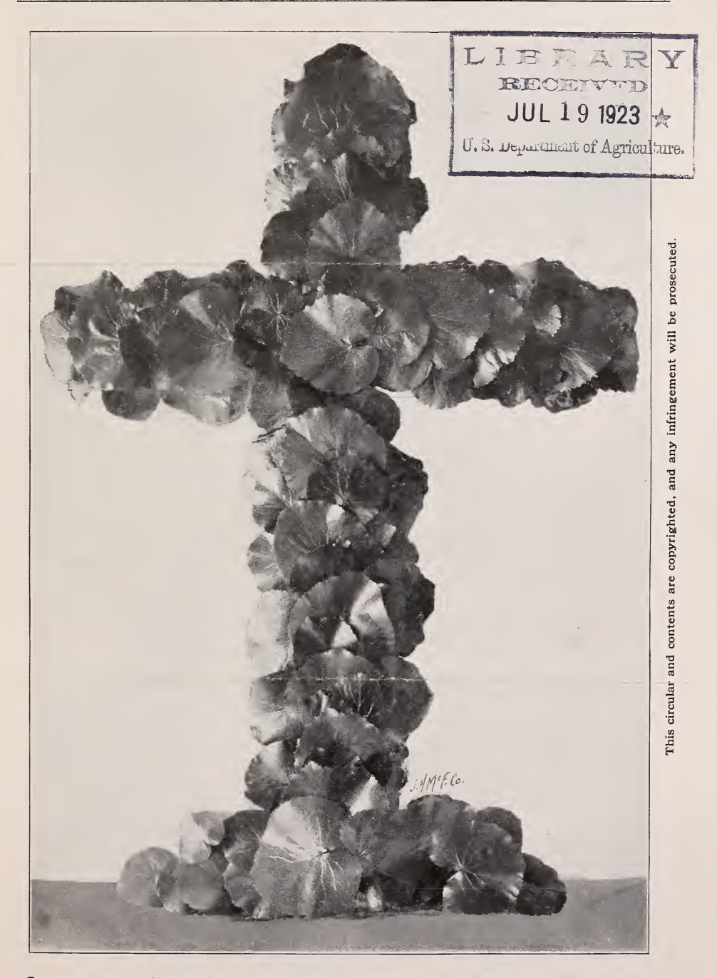
CROSS MADE OF KELSEY'S BRONZE GALAX LEAVES.