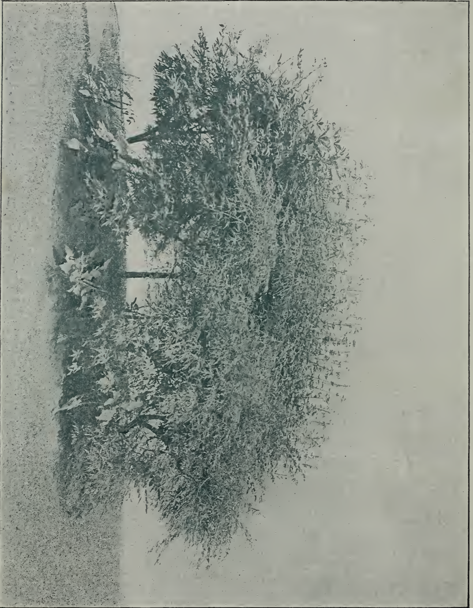
MASS GROUP OF HARDY JAPAN MAPLES PLANTED TEN YEARS.