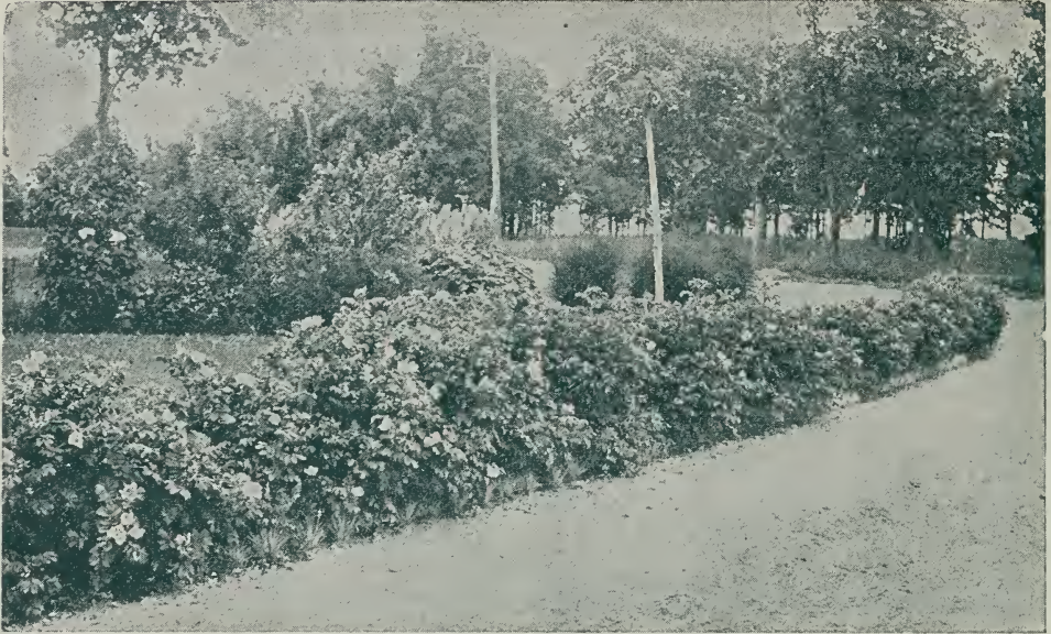
ROSA RUGOSA AS A BORDER TO DRIVEWAY. (SEE PAGE 13).