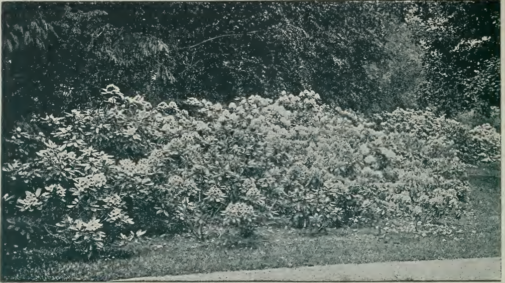
HARDY RHODODENDRONS BY DRIVEWAY. EVERGREENS IN BACK GROUND.