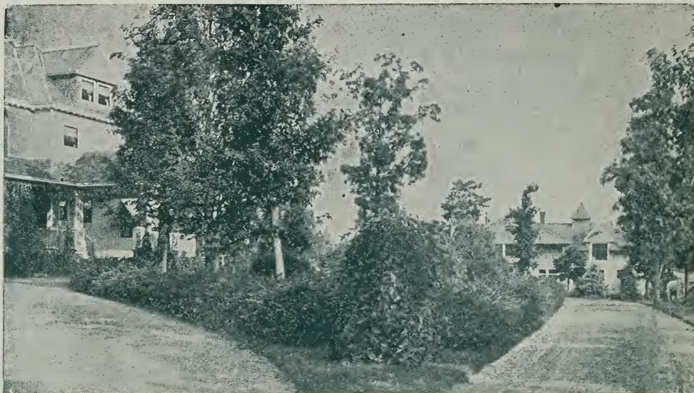
BERBERRY THUNBERGII GROWN AS A HEDGE BORDER.

OF TRAINED SPECIMENS for formal gardening, many desirable trimmed evergreens and deciduous shrubs can be supplied at reasonable prices. Also specimens for single or group planting.