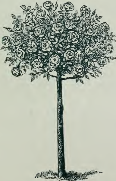
EXPOSITION STANDARD ROSE.

Alfred Colomb, American Beauty, Anna de Diesbach, Baroness Rothschild, Baron de Bonstettin, Baronne Prevost, Clio, Coquette des Alpes, Charles Lefebvre, Countess of Oxford, Dawson, Duke of Endinburgh, Earl of Dufferin (magnificent dark velvety crimson), Etienne Levet, Eugene Verdier, Francois Levet, Francois Michelin, Fisher Holmes, Gen. Jacqueminot, Gen. Washington, John Hopper, Jules Margottin, La France, La Reine, Louis Van Houtte, Marchioness of Dufferin, Mad. Gabriel Luizet, Mad. Plantier (see Surplus List, page 2), Mabel Morrison, Marchioness of Lorne (new; large, beautiful carmine; fine), Magna Charta, Margaret Dickson (superb white), Marie Bauman, Marshall P. Wilder, Marveille de Lyon, Marchioness of Londonderry (new; extra large, fine white), Mrs. J. Laing, Madame Plantier, Paul Neyron, Persian Yellow, Pierre Notting, Prince Camille de Rohan, Sir Roland Hill (new; grand Rose; fine, dark purple), Ulrich Brunner, Victor Verdier, Xavier Alibo, and others. STRONG, FINE TWO YEAR PLANTS , $3 to $5 per doz., $20 to $30 per 100; smaller plants, $10 and $15 per 100. Special quotations per 1,000 on request.