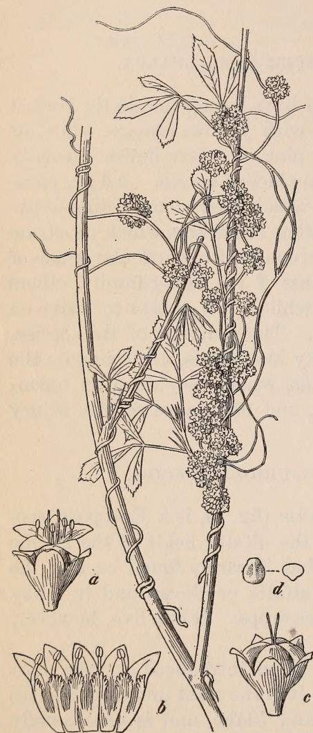
FIG. 1.—Alfalfa dodder: a , flower; b , corolla detached and spread out, showing the scales on its inner surface; c , mature seed pod; d , seed and outline of transverse section of same. Plant, scale \frac{2}{3} ; details, scale 4.

Dodder seeds placed in the soil germinate, under favorable conditions, in practically the same manner as do the seeds of clover or other plants, but instead of two green leaves there appears above the surface a very slender, inconspicuous yellow shoot. This bends to one side, then swings slowly