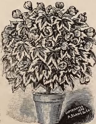
SOUVENIR DE BONN.