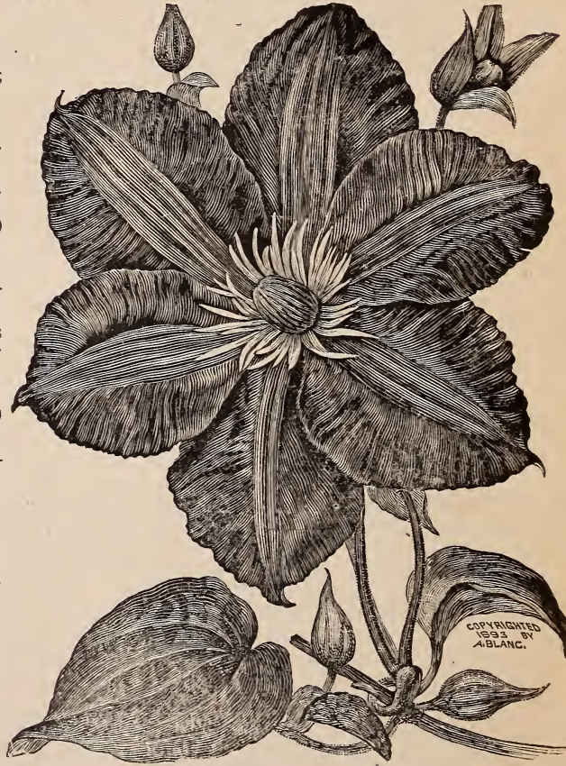
JACKMANII—See page 7.