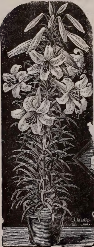
Bermuda Easter Lily.

We allow 10 per cent. discount on goods quoted