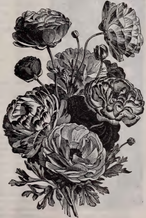
25 Bulbs at 100 rate. Ranunculus.

Very best mixed, all shades, per dozen, 10 cts.; per 100, 40 cts.; per 1000, $2.50.