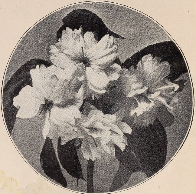
- Cherry. (See page 3.)