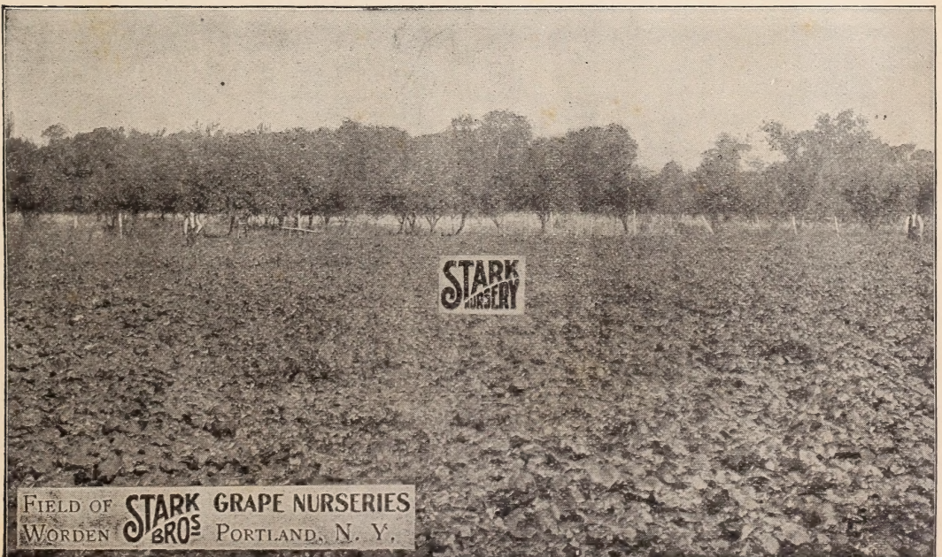
FIELD OF STARK GRAPE NURSERIES WORDEN BROS PORTLAND, N. Y.