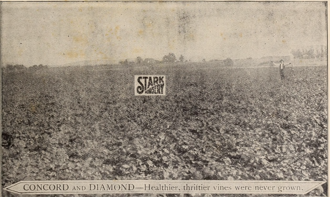
CONCORD AND DIAMOND—Healthier, thriftier vines were never grown.