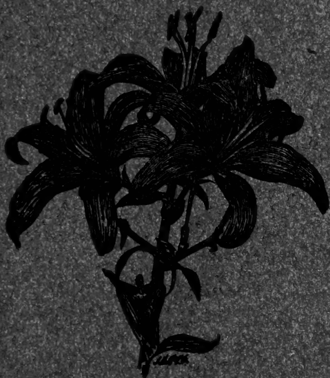
Lilium elegans fulgens. (See page 4.)