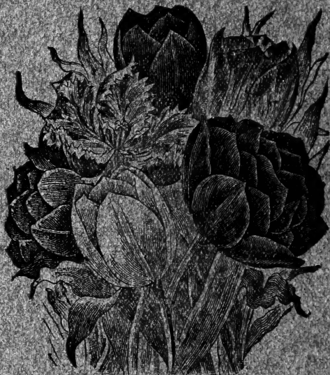
Single, Double and Parrot Tulips. (See page 4.)