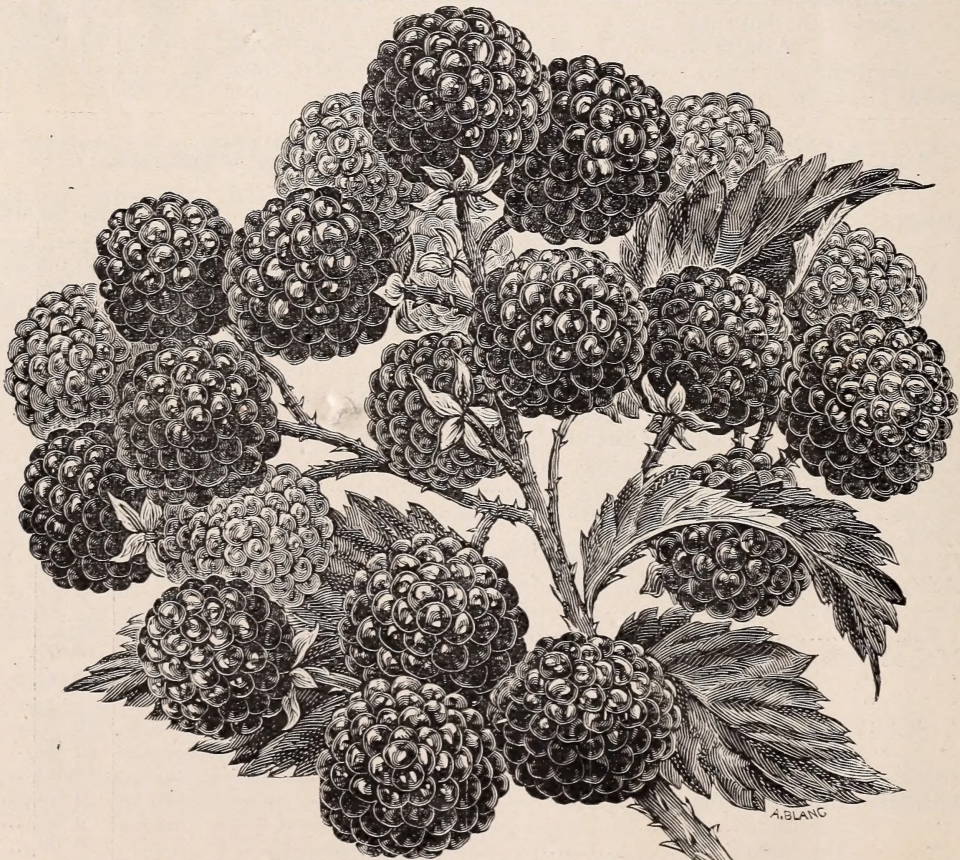
Cumberland —The largest of all Black-caps. A healthy, vigorous grower, throwing up stout, stocky, well branched canes that produce immense crops of magnificent berries. Fruit very large, firm, quality about same as Gregg, keeps and ships as well as any of the Blacks. The most profitable market variety.