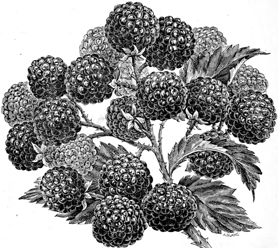
Cumberland —The largest of all Black-caps. A healthy, vigorous grower, throwing up stout, stocky, well branched canes that produce immense crops of magnificent berries. Fruit very large, firm, quality about same as Gregg, keeps and ships as well as any of the Blacks. The most profitable market variety.