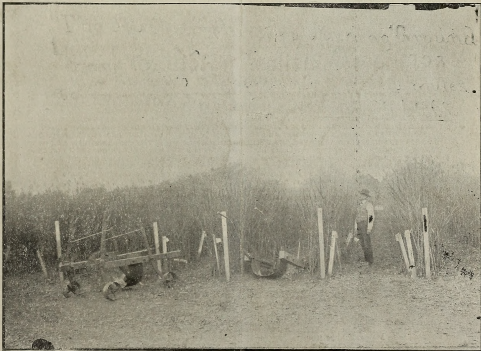
The above shows a few of my one year old peach trees, heeled in ready for orders November, 1903. I believe such large trees will bear six bushels of fruit before small ones will bear three bushels.—Eight mules were worked to each of the two diggers for two weeks.

RESIDENCE, OFFICE, AND GROUNDS NEAR ELECTRIC CAR LINE HYDE PARK