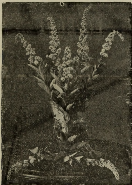
SPIREA TOMENTOSA ALBA

Hardy Ornamental Trees Shrubs & Herbaceous Plants