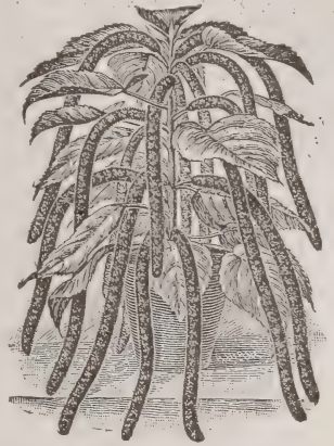
Chenille or Comet Plant.

Sometimes called the Philippine Medusa . This is the most distinct and striking ornamental plant introduced in many years. It is a native of the South Sea Islands. Of easy and rapid growth, and blooms continuously. Of branching habit, healthy foliage and remarkable flowers. The flower spikes, which appear in pairs from the axils of the leaves, grow from 2 to 3 feet in length, and are of bright crimson color, drooping and mixing among the green foliage with charming effect. For bright and curious effect it has no equal. Has attracted universal attention and admiration wherever exhibited.