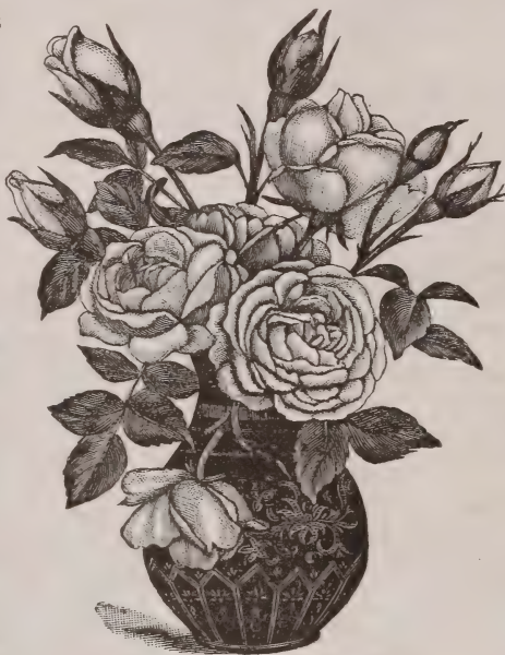
BOUQUET OF DEWEY ROSES.

THE DEWEY ROSE COLLECTION of 15 choice named Roses in large two year old plants for $2.00 by mail, postpaid; or by express for $1.75, purchaser paying charges.