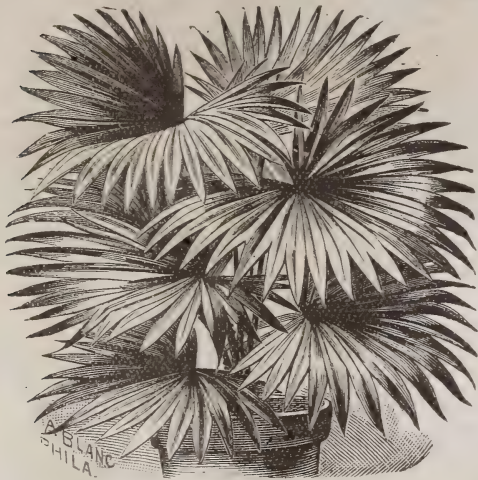
DWARF PALM, LIVISTONA ROTUNDFOLIA.

Indispensable for all decoration, whether in or outdoors, and for tropical bedding. They are easily grown and increase their value two to fourfold every year. Please Notice that all Palms have, when young, leaves of a long, narrow shape, developing as they grow older. Therefore do not think that a wrong sort has been sent you.