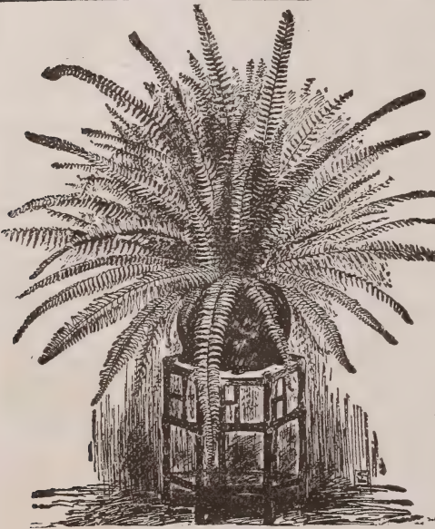
THE BOSTON SWORD FERN.

The Boston Sword Fern —(Nephrolepis Bostoniensis)—This graceful Fern differs from the ordinary Fern in having much longer fronds, which frequently attain a length of four feet. These fronds arch and droop over very gracefully, on account of which it is frequently called the Fountain Fern. This drooping habit makes it an excellent plant to grow as a single specimen on a table or pedestal. 20 cents each; strong plants 50 cents; extra large specimen plants $1.00.