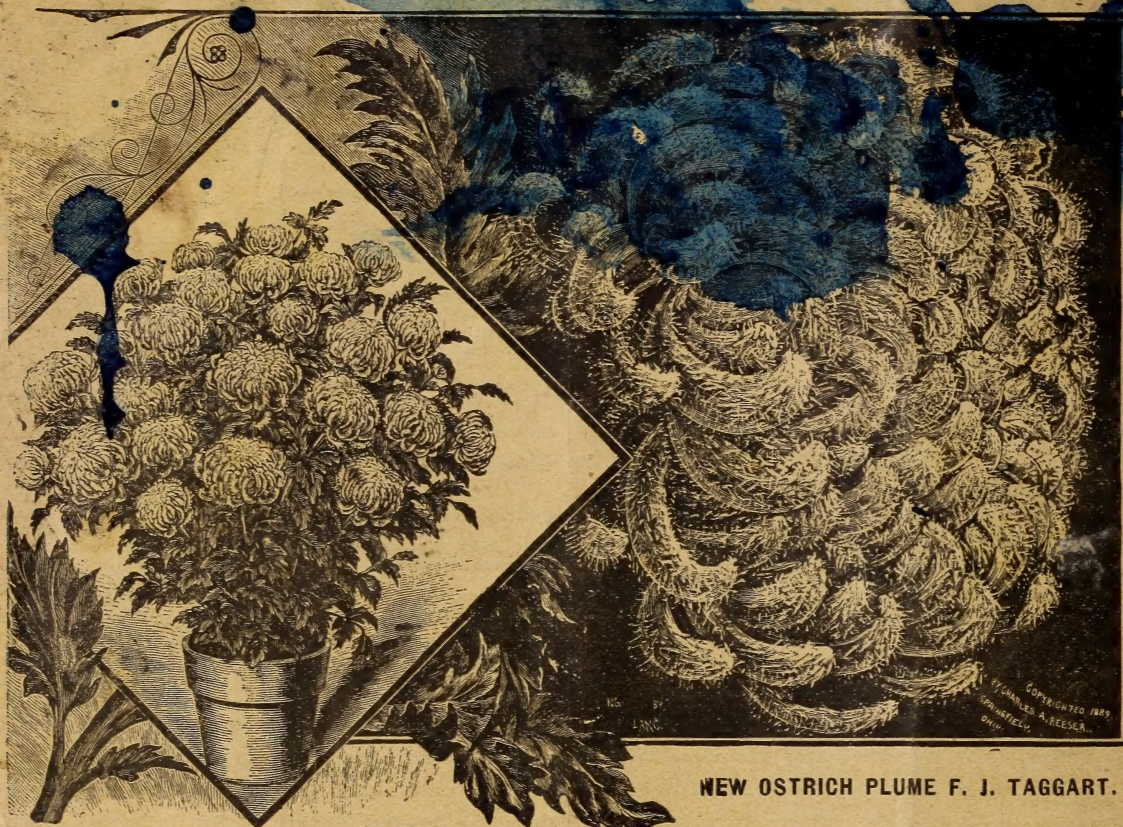
NEW OSTRICH PLUME F. J. TAGGART.

The Flowers of the following varieties are enormous and are the sensations of the exhibitions. Every one is a blue-blooded, pedigreed variety, all from carefully selected crosses, and not from chance seedlings.