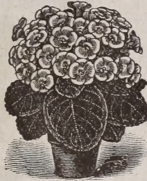
Gloxinias GORGEOUS FLOWERED GLOXINIAS.

This gorgeous exotic is easily grown and cared for; will bloom in six weeks from time dry bulb is planted. Keep bulbs in pots in the house, or on the veranda, in boxes or little frames outside, and you can cut flowers all Summer. Bulbs should be started in a warm place—greenhouse, hotbed or sunny window. Will bloom till late in Summer, when they should be dried off, letting the leaves die; pots can be kept over Winter in cellar free from frost. Price, 10 cents each; 6 for 50 cents.