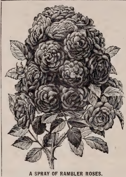
A SPRAY OF RAMBLER ROSES.

New Golden Yellow Rambler, Alistar Stella Gray —New. Belonging to the Rambler section of Roses. We know it to be a grand Rose, and have tested its hardiness. You will make no mistake in buying it, as you will have a grand, free-blooming climbing yellow Rose. Is a continuous bloomer, laden with bunches of buds of orange yellow. 10 cents; 3 for 25 cents; large two year old plants, 35 cents.