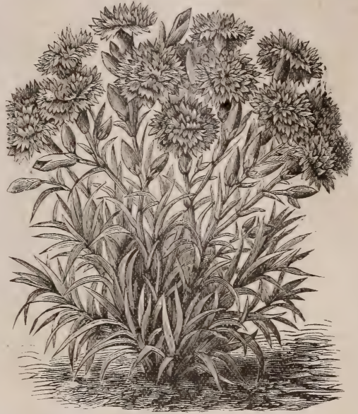
Mrs. Lawson—The $30,000 Carnation.

Norway —Pure white, large size, good form and substance; extraordinary strong calyx, fragrant, borne on long, stiff stems that always carry bloom erect; extra fine, early continuous bloomer; fine habit; strong, free, healthy grower.