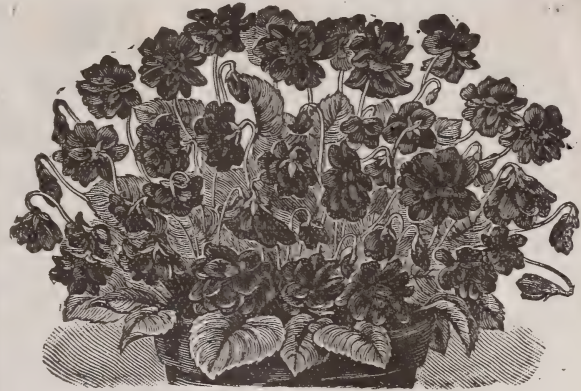
VIOLET, LADY HUME CAMPBELL.

Lady Larpent —This beautiful variety is unquestionably the most distinct and valuable hardy herbaceous plant now in cultivation. The plants are strong, upright in habit, growing to a height of twelve to fifteen inches in compact clumps, and from the middle of July until severe frost are covered with lovely, rich violet-blue colored flowers borne in close terminal heads. Price, 10 cents each.