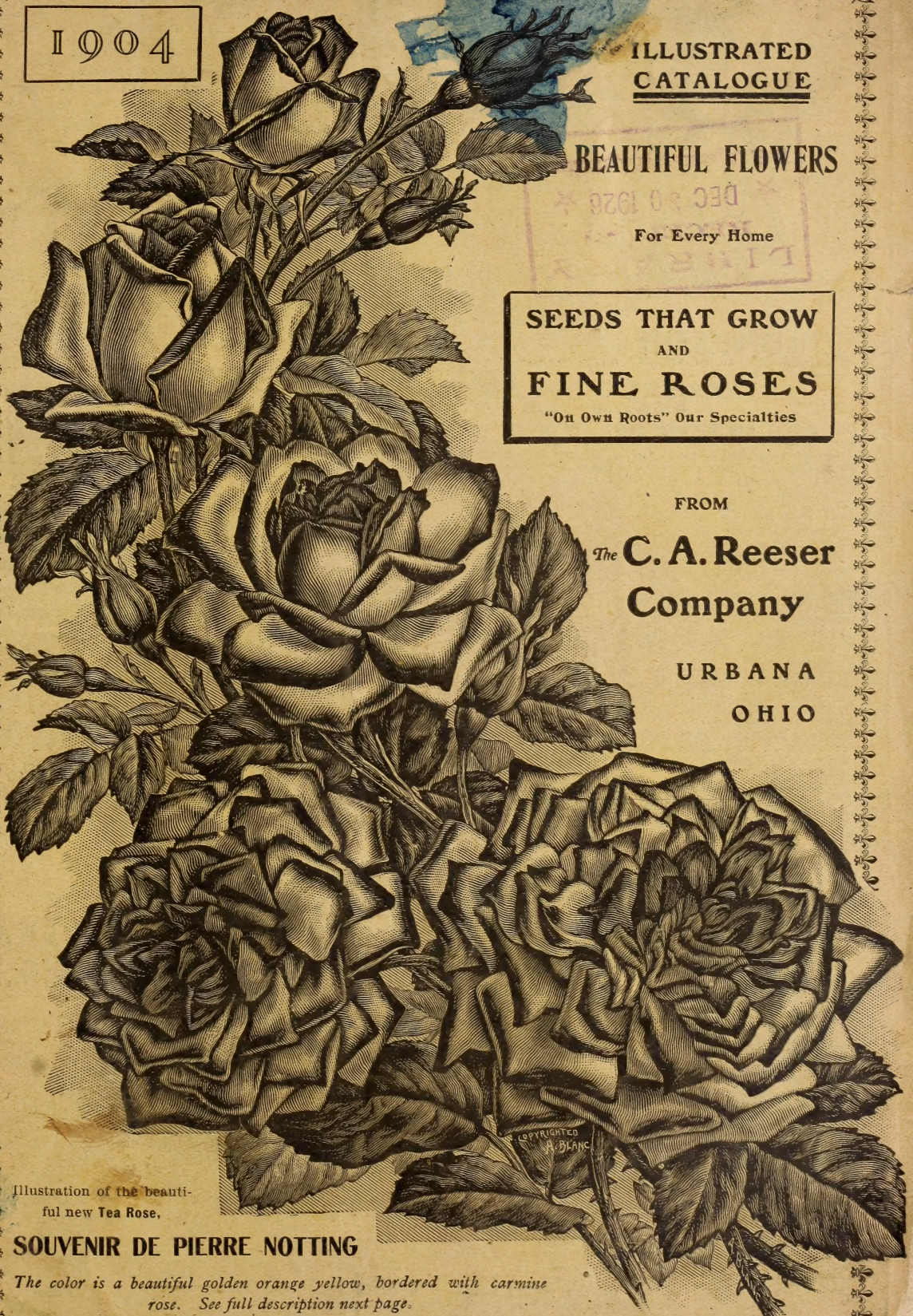
Illustration of the beautiful new Tea Rose,