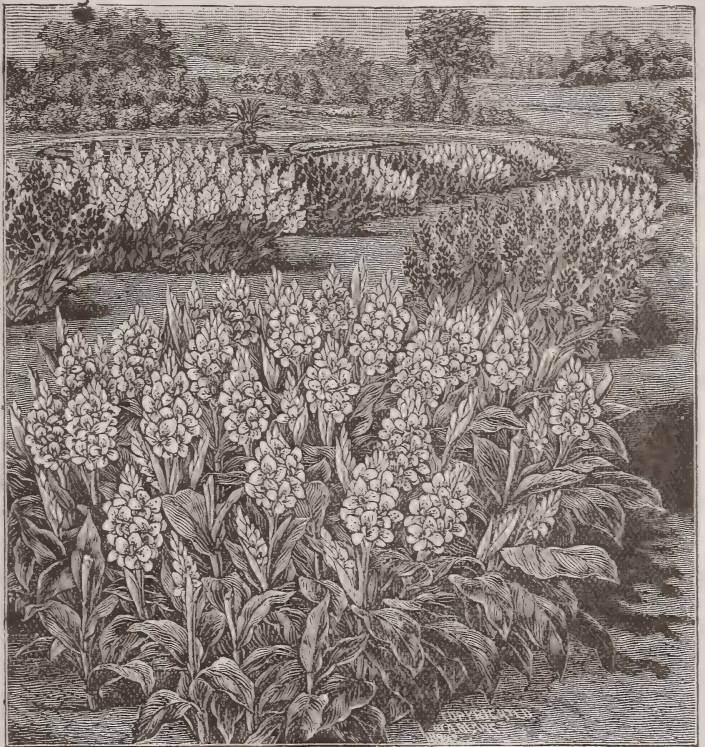
EVER-BLOOMING CANNAS, America's Most Popular Bedding Plants.

SPECIAL OFFER —For only $1.00 we will mail you, postpaid, this "CREAM COLLECTION" of 12 new Cannas. The best in the world. Don't fail to get the entire set. No further discount.