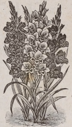
Superb Seedling Gladioli.

Fancy Flowering Dahlias —Always great favorites, and now have attained a height of perfection that seems impossible to improve. The roots should be set about 4 feet apart in a rich, loamy soil, mulched with well-rotted manure. Price, 15 cents each; 8 fine sorts for $1.00.