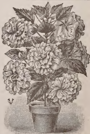
NEW DOUBLE PINK HIBISCUS PEACHBLOW.

Zebrius —Double, outer petals scarlet, edged with yellow, inner petals very regular and curiously variegated with creamy yellow scarlet. 10 cents each.