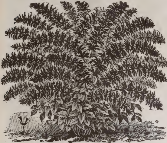
NEW DWARF SALVIA BONFIRE.