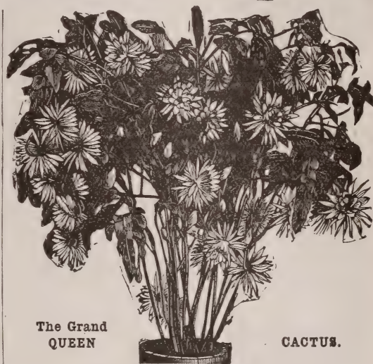
The Grand QUEEN