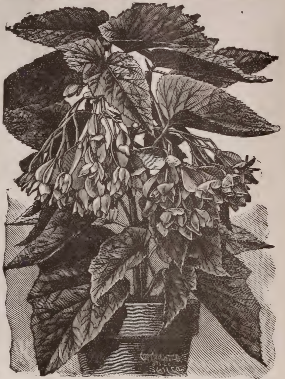
NEW FLOWERING BEGONIA, OTTO HACKER.

Sandersonii —Coral Begonia. The flowers are of a scarlet shade of crimson, borne in profusion. Leaves slightly edged with scarlet. Price, 10 cents.