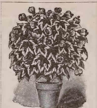
ABUTILON, SOUV. DE BONNE.

Royal Scarlet —Needs no other description than its name, which was aptly given. Very free and of excellent habit.