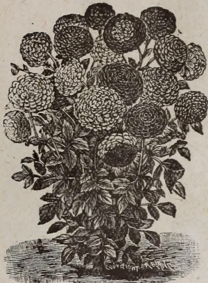
Fancy Flowering Dahlias.