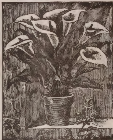
New Calla, Fragrance.

New Calla, Little Gem —This little pigmy rarely exceeds 12 inches in height and blooms most abundantly. The flowers are not more than half the size of the common variety and, therefore, can be used with telling effect in bouquets. It is in every way superior as a house plant to the larger growing variety. Price, 15 cents each; extra large bulbs, 35 cents.