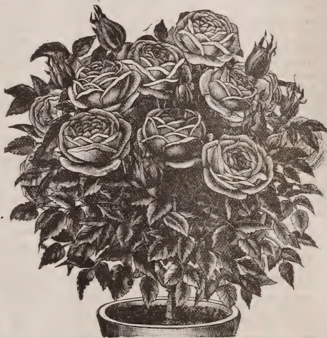
Hardy Ever-Blooming Rose, Dinsmore.

Madame Masson —An excellent Hybrid Perpetual, noted for its constant and profuse bloom. The flowers are large; color, a clear, bright Rose, highly perfumed. One of the best for planting. This Rose is a very superb variety, and should be more generally known. Try it. Price, 15 cents each; large two year old plants, 35 cents each.