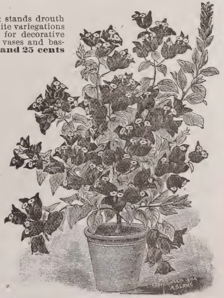
Bougainvillea Sanderiana—Chinese Paper Plant.