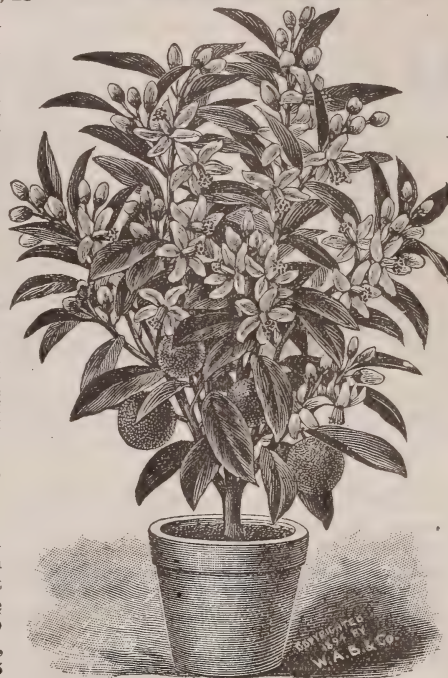
Dwarf Otaheite Orange.

blooming pot plant for house culture, and is of the easiest culture. Flowers and fruits when but twelve to fifteen inches high. As a pot plant this is one of the most novel. Price, 10 cents each; large, strong plants, 25 and 40 cents.