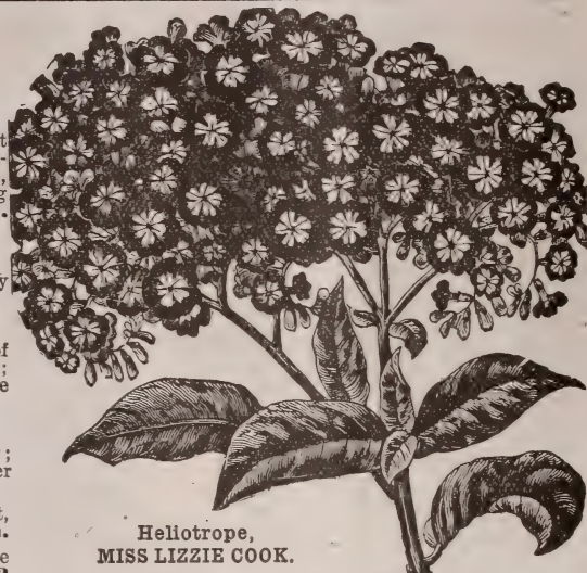
Heliotrope, MISS LIZZIE COOK.

Snow Wreath —Superb large clusters of deliciously fragrant flowers of pure white. Price, 10 cts. each.