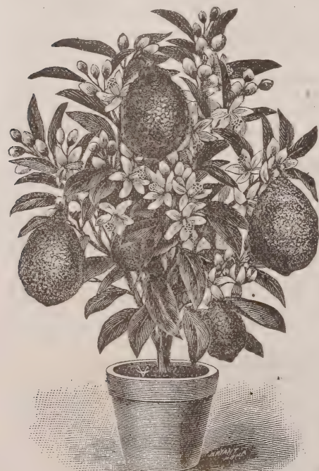
Ponderosa—Wonderful New Lemon.