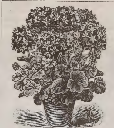
Geranium Double New Life.

Glorie de Bondeneau, New —Large, round florets, of waxy appearance; color: carmine and white, with carmine center, each petal delicately edged with carmine. An excellent pot variety, to which its habit is finely suited. It is one of the prettiest Geraniums we know. This is the most beautiful of the parti-colored Geraniums, which appear so bewitching.