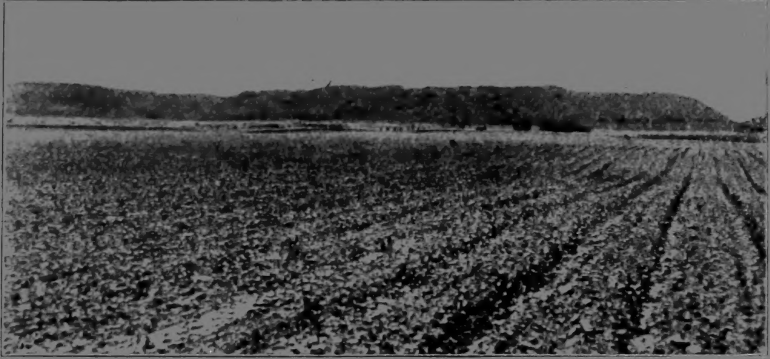
350,000 Jewell apple grafts - one month from setting