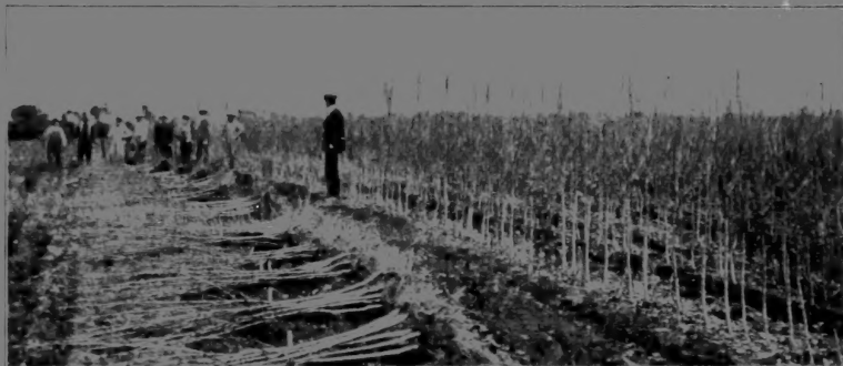
Pulling and Grading Jewell Apple Trees