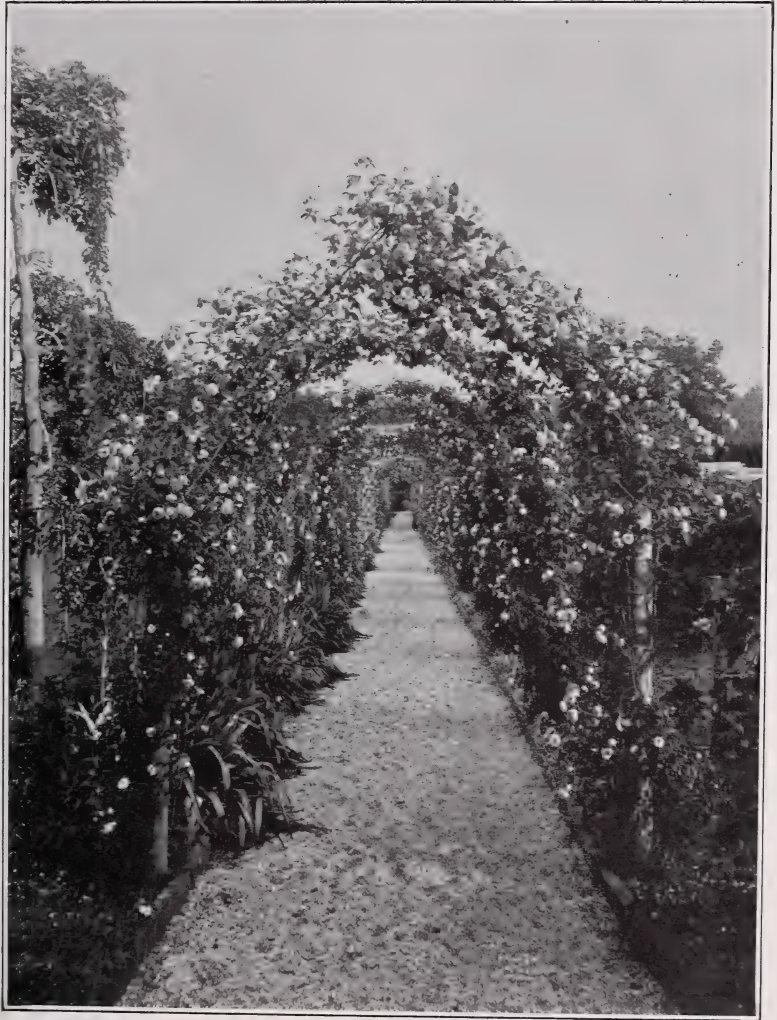
A ROSE WALK A Charming Employment of Climbing Roses