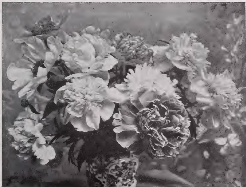
A VASE OF MODERN PEONIES

Printers' ink, the most useful of all mediums in the dissemination of man's knowledge, seems utterly inadequate to convey to you, who may not have seen them, some conception of the matchless, regal beauty of the modern type of this flower. Could I take you into my