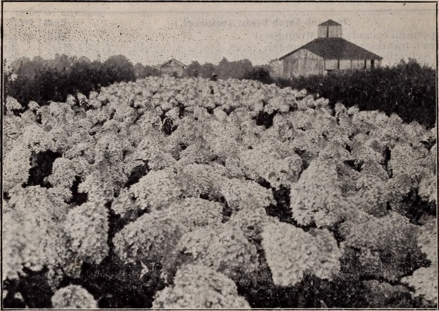
A BLOCK OF 20,000 HYDRANGEA, P. G., 2 YEARS OLD.