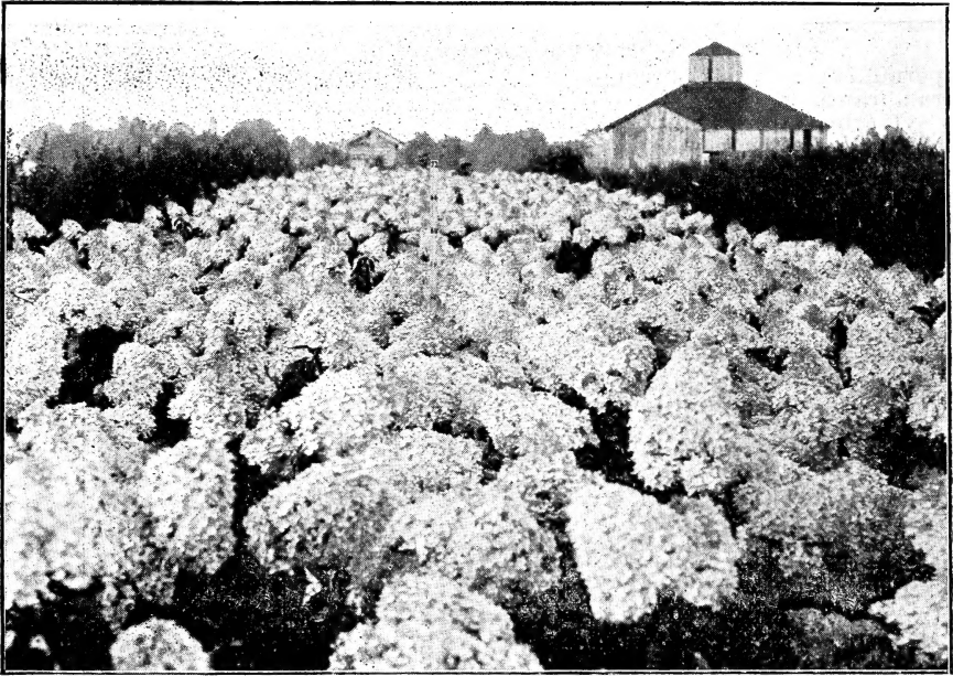
A. BLOCK OF 20,000 HYDRANGEA, P. G., 2 YEARS OLD.