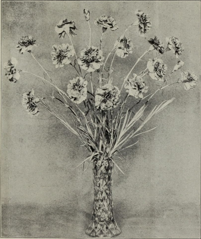
Vase of Pink Carnation Hannah Hobart

GROWERS AND INTRODUCERS JOHN H. SIEVERS & CO. SAN FRANCISCO, CAL.