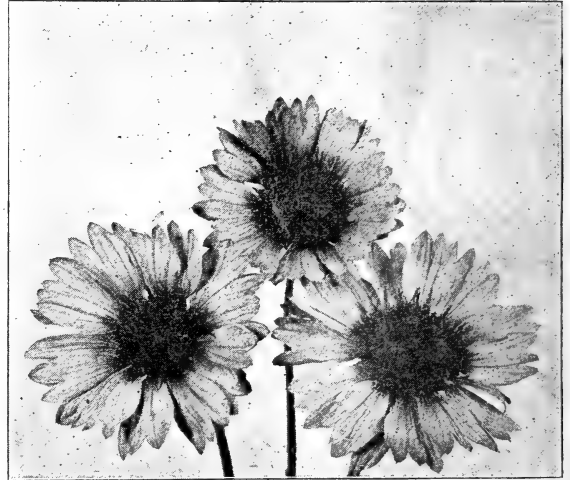
GAILLARDIA. (See page 120.)

Daisy, Double English—Red and White. $3.00 per 100. Delphinium. (Larkspur).—Formosum, Chinensis, Coelestinum, and mixed Hybrids. $5.00 per 100. Dianthus Barbatus. (Sweet William).—$4.00 per 100. Dicentra Spectabilis (Bleeding Heart)—$7.00 per 100. Dictamnus Fraxinella—Rubra. $6.00 per 100. Dictamnus Fraxinella—Alba. $8.00 per 100. Digitalis (Fox Glove)—Gloxiniaeflora and Gloxiniaeflora Alba. $8.00 per 100. Eupatorium Purpureum. (Snake Root)—$5.00 per 100. Funkia Subcordata (Alba)—Strong roots. $5.00 per 100.