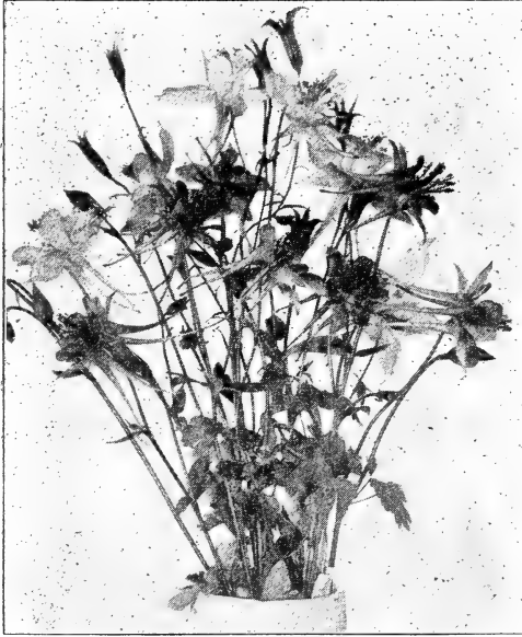
AQUILEGIA Caerulea .

Our list includes all of the Hardy Herbaceous plants that are of value to the commercial florist. Anemone Japonica, Alba Rubra, Whirlwind and Queen Charlotte.—Strong field-grown. $5.00 per 100; 2 inch pots, in May, $3.00 per 100.