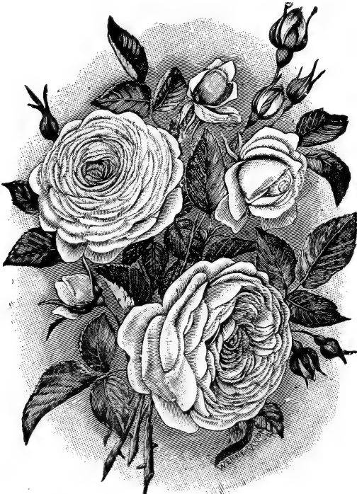
FLOWERS OF CLIMBING SOUPERT.

Clotilde Soupert —A grand little Rose for bedding or pot sales. Used largely for cemetery planting. Flowers delicately tinted flesh white. One of the most persistent bloomers and strongest growing of the Polyantha class.