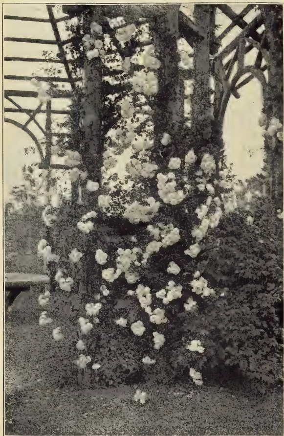
"Lady Gay," the splendid new Rambler. Notice how full each individual flower, and how large the clusters

Lady Gay A most attractive novelty, being equally admired for the brilliant coloring of the flowers and the abundance in which they are produced. The color is a deep, clear and rich rose-pink, the individual flowers being large for their class, full, and arranged in immense clusters. We want you to be sure to try this, no difference how small your collection, for we consider it among our most valuable kinds. It is different from all other