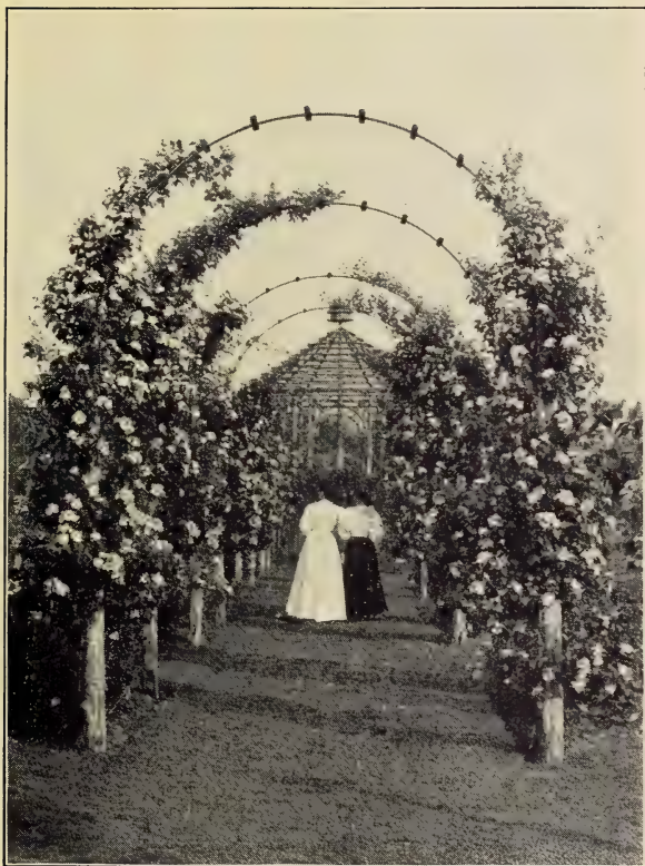
Part of a rose-garden in New England, with Ramblers of the new varieties trained to arches (See page 34)

flower-bud. In color it is intense brilliant crimson, shaded scarlet; very large and exquisitely formed, with large, smooth petals, slightly cupped and reflexed at the edges. The center is high and pointed. It is unquestionably the finest rose of its color, never burning in the sun, and retain-