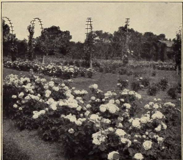
A garden of Heller's Roses

Designed, Photographed, Engraved and Printed by J. Horace McFarland Company Mount Pleasant Press Harrisburg, Pa.