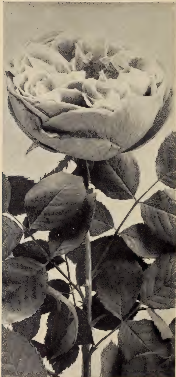
Notice the strong stem, the full perfect flower, the fine full foliage of the "true" American Beauty