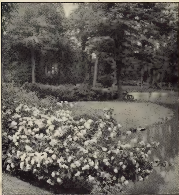
A bed of roses in Connecticut

Before shipping, all our roses have the roots dipped in heavy, wet clay, making them practically air-sealed. They are then quickly wrapped in heavy waxed paper, and packed in excelsior in a good strong box. Always the roots are kept from exposure, and they are so packed as to avoid damage on the way, no matter how far they have to go.