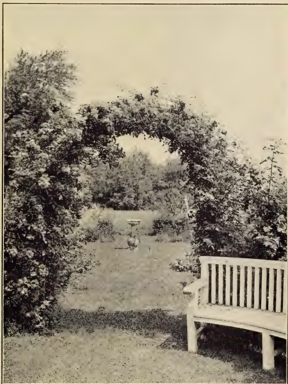
Illustrating the possibilities of making beautiful arches of Rambler roses planted with Clematis paniculata. (See page 34)

deep pink that does not fade in the sun. It is somewhat similar to the Caroline Testout, except that it is much finer and makes longer and better stems and stronger foliage. We cannot speak too highly of this for a fine pink rose. One-year size, 25 cts. each; 2 years, 50 cts.; 3 years, $1.