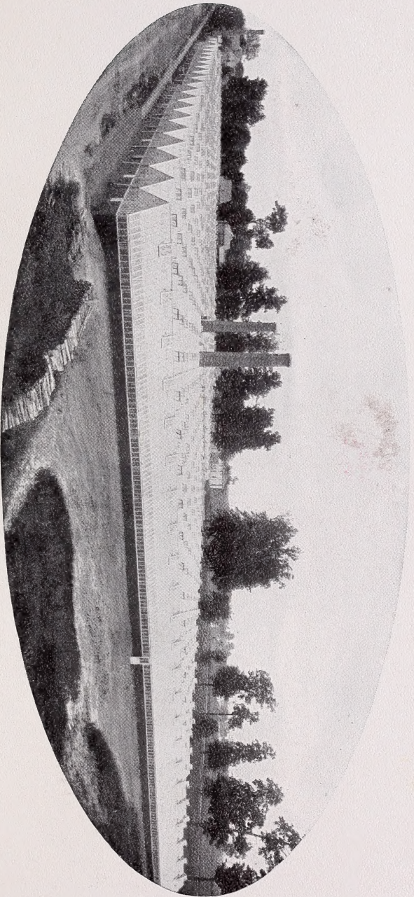
Our greenhouses consist of thirty buildings each 300 feet long and 25 feet wide, containing 100,000 growing rose-bushes