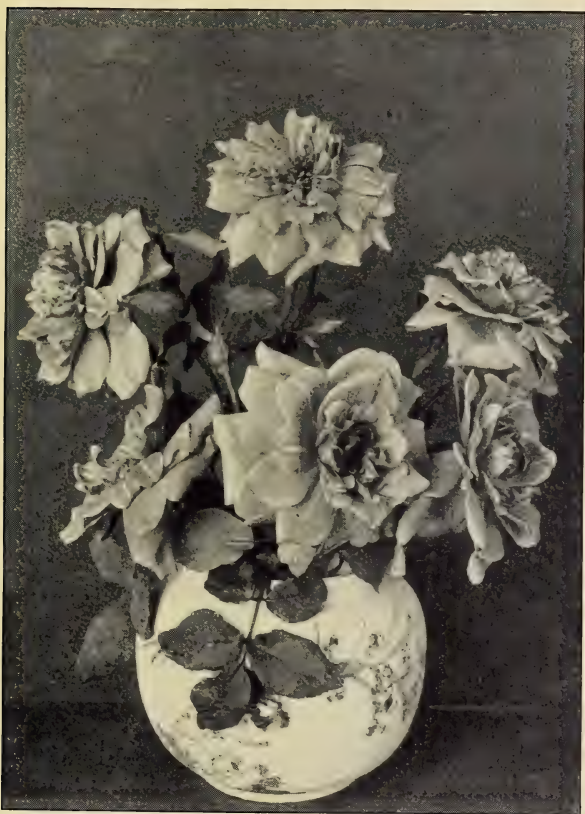
A small vase of good old-style garden roses.

Mrs. Mawley This is an English rose, and seems to be a great favorite among the amateur rose-growers of England. In a recent London flower show it took prizes in all classes, and we think it a fine variety, worth giving a trial. It is a pure tea rose of good stems, large, full flowers and of a brilliant rose-pink color. One-year size, 10 cts. each; 2 years, 25 cts.; 3 years, 50 cts.