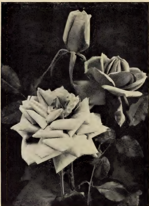
Just such roses you can pick almost any time from a home rose-garden

Souvenir de Pierre Notting This wonderful rose has been awarded highest honors in Germany, France, Belgium and England, receiving a gold medal at the Paris Exposition. It is of strong bushy habit, with fine dark green foliage, making so healthy a growth that it is almost immune against disease. Throughout the season it is always in bloom, and its delicious fragrance and long, straight stems, bearing large, full flowers of a beautiful yellow with delicate shadings of pink and saffron, render it invaluable to the amateur gardener.