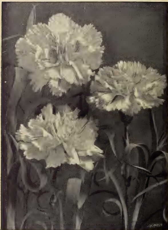
Carnations grown at home will have fine foliage and beautiful buds

Cardinal For a brilliant red carnation, this is probably the best variety we have. It possesses qualities that have always been hard to get in a carnation of this color. Its growth is strong, and the flowers are large and of a most brilliant scarlet-red. 10 cts. each, $1 per dozen.