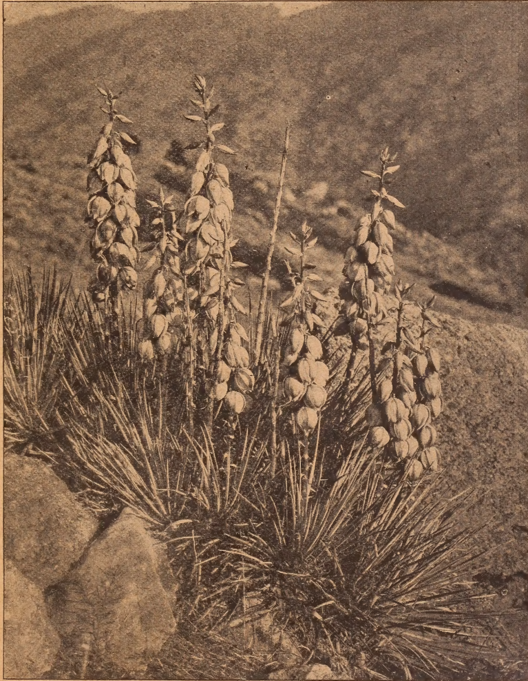
Yucca Glauca.