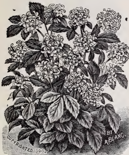
Clematis Davidiana (See Page 12)

Coreopsis palamta. Masses of golden yellow flowers, July and Aug., on neat plants a foot high, with finely divided foliage.