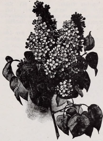
Syringa, Garden Lilac.

Syringa Persica alba, Persian Lilac. (6-8 ft)