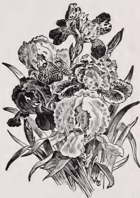
German Iris (See Page 14)

Liatris pycnostachia. Kansas Gay Feather