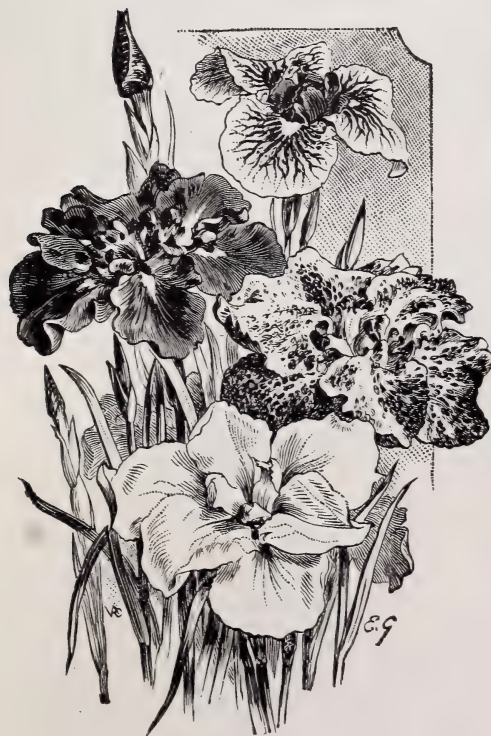
Japanese Iris (See Page 14)