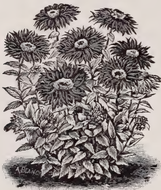
Inula glandulosa grandiflora

These magnificent Iris are among the most beautiful hardy flowers which can be grown in the garden in this climate. They commence blooming about the middle of June and continue five or six weeks. The flowers frequently measure eight or ten inches across, and the variety and richness of their coloring and exquisite veining cannot adequately be described, nor shown in an engraving, (see cut). My collection was imported directly from Japan, and I have been growing and propagating them for a number of years, so that they are fully acclimated. These are all choice named varieties, no inferior or mixed sorts, and I offer them in collections, each carefully labeled