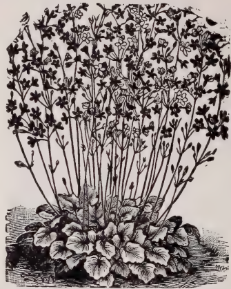
Heuchera sanguinea (Crimson Bells)

der open sprays of red flowers all summer. (see cut.)