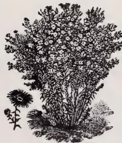
Aster Nova-Angliae (See Page 12)

Baby Rambler. Not a Hybrid Tea, but a wonderfully free blooming rose for summer bedding or pot culture.