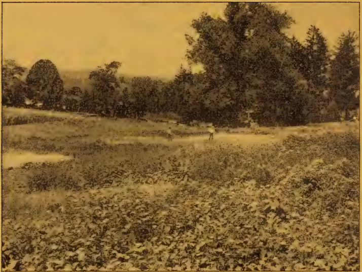
Partial view of Herbaceous Plantations