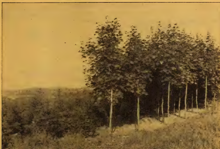
End View of a Block of Norway Maples