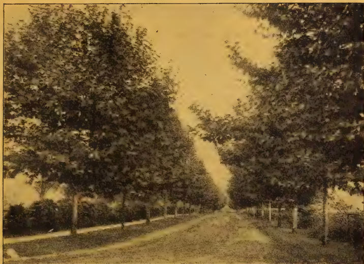
An avenue of "Andorra-grown" Oriental Planes. (See page 30)