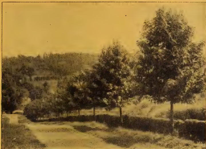
An avenue of Sweet Gums (Liquidambar), at Andorra