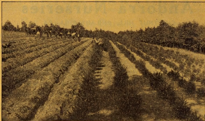
Transplanting Norway Spruce