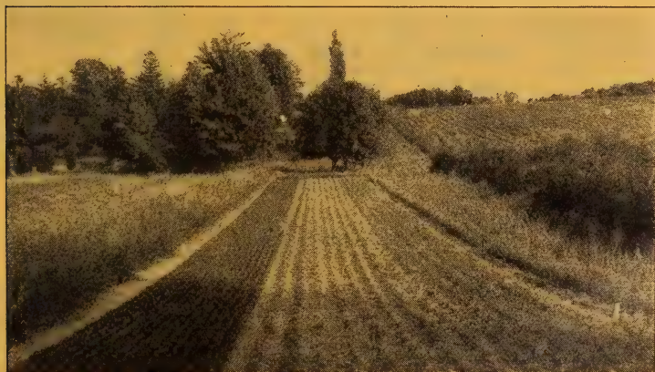
A portion of the propagating grounds at Andorra