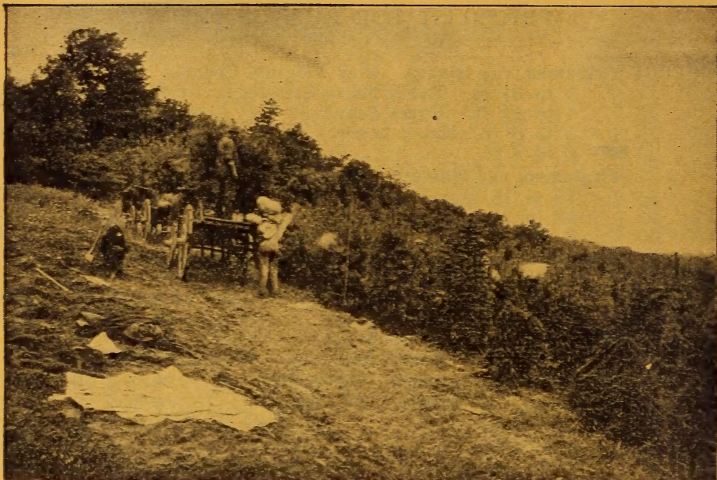
Loading White Pines