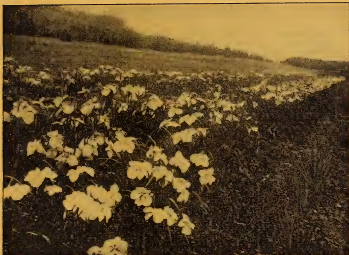
A field of Japanese Iris at Andorra