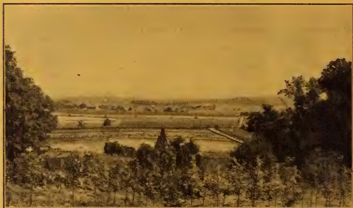
Partial view of Nursery grounds from top of Main Nursery