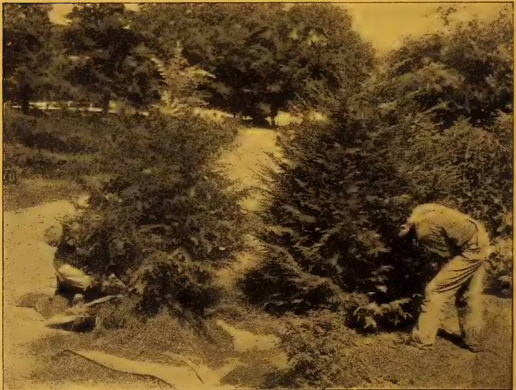
Showing fibrous roots of hemlock.