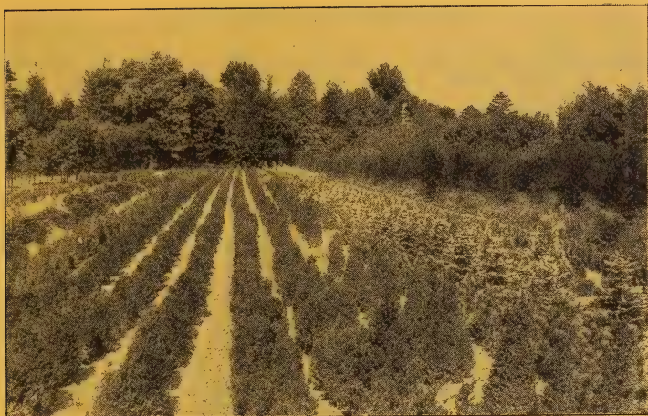
A Block of Box Bush and Evergreens.