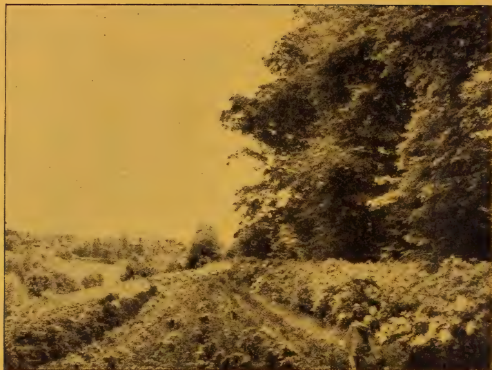
Rhododendrons at Andorra