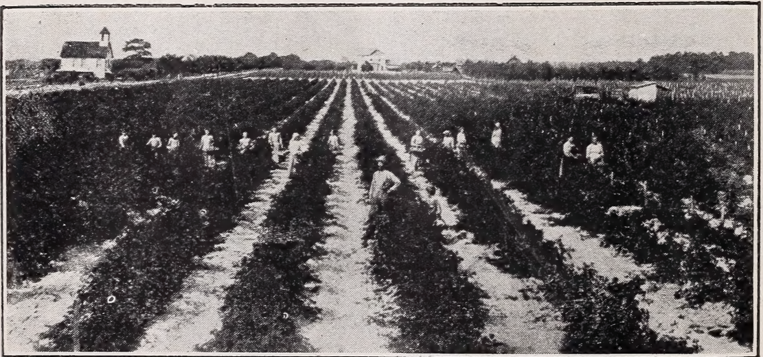
A FIELD OF BLACK DIAMOND BLACKBERRIES

For reference write to Vineland Trust Co., enclosing stamp for return.