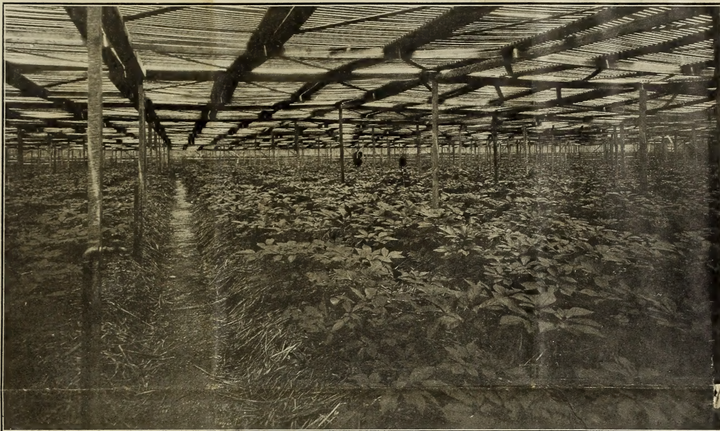
Section of McDowell Ginseng Garden, No. 3