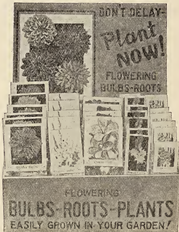
Bulbs in Cellophane Bags

Roses—Wrapped and cartoned Shrubs and Hedging Perennial and Rock Garden Plants Fruit and Ornamental Trees Evergreens Bulbs In Cellophane Bags