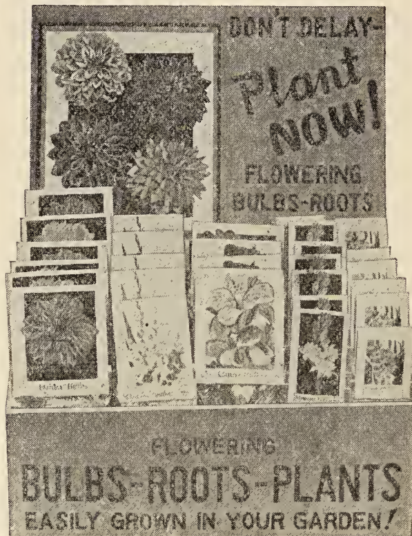
Bulbs in Cellophane Bags

Roses—Wrapped and cartoned Shrubs and Hedging Perennial and Rock Garden Plants Fruit and Ornamental Trees Evergreens Bulbs In Cellophane Bags