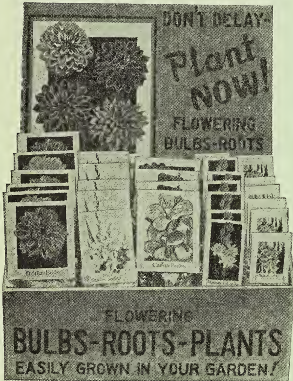
Bulbs in Cellophane Bags

AN ATTRACTIVE, PROFITABLE DISPLAY FOR FLORISTS, SEEDSMEN, NURSERY STORES, SALES GROUNDS, ETC.