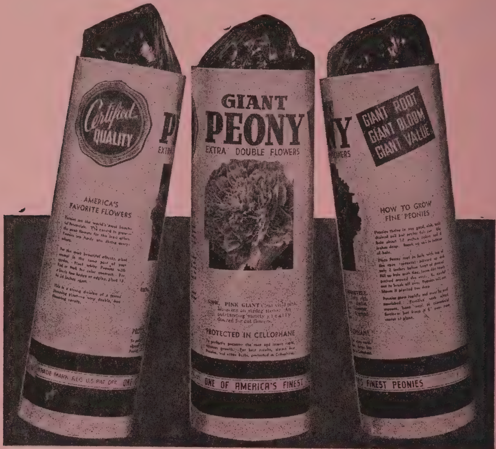
Mount Arbor's Cellophane Wrapped Peonies