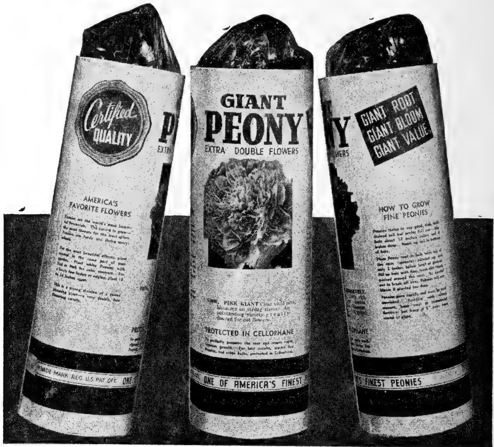
Mount Arbor's Cellophane Wrapped Peonies